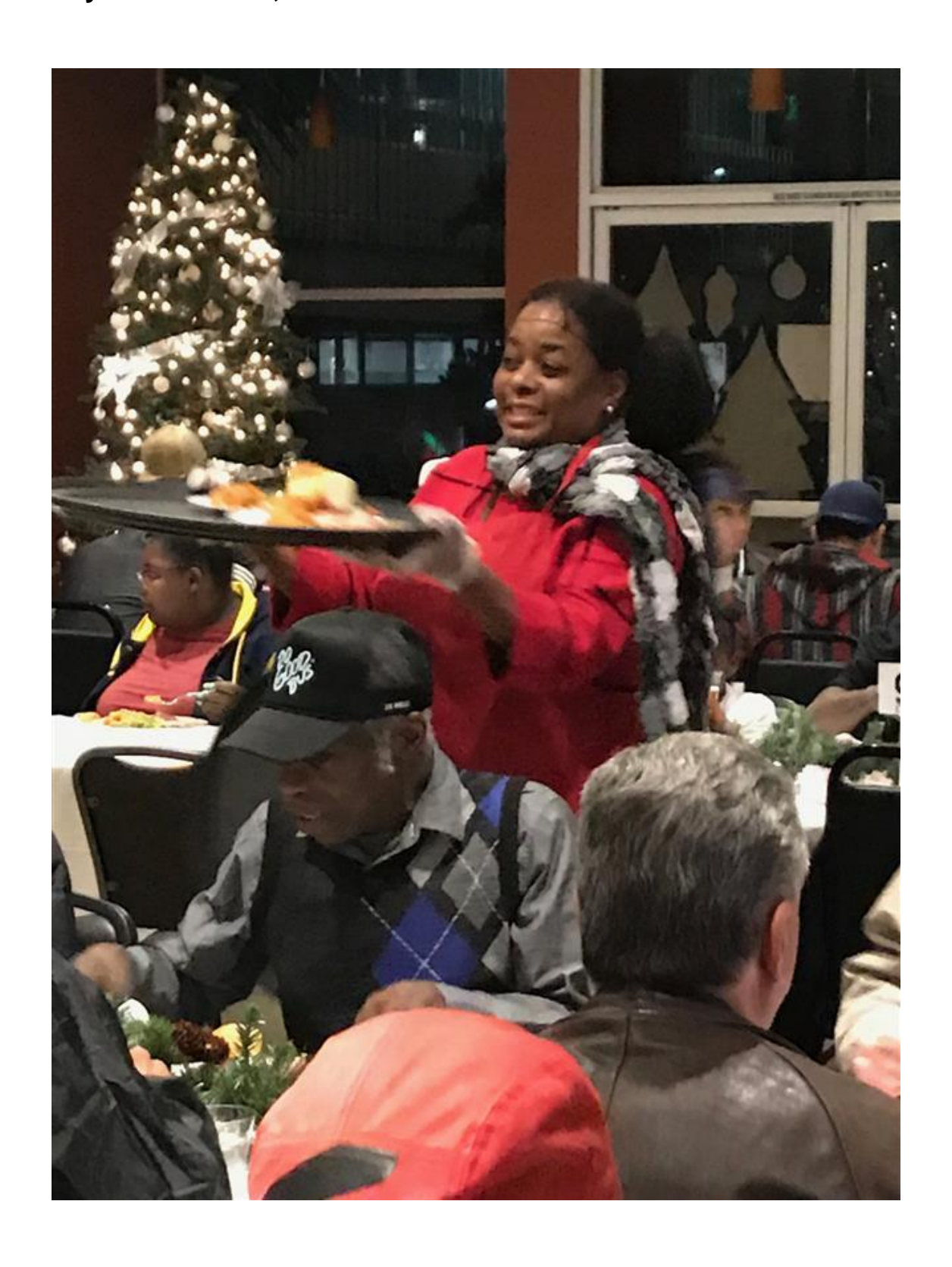
LAWA Team Members Help Serve Holiday Dinner, Contribute Toys to US VETS, Inc.