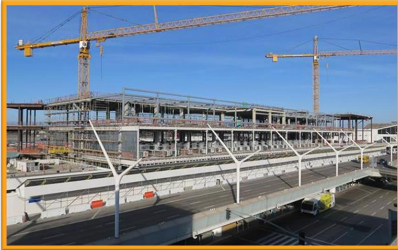
Terminal 2 / 3 Head House and Departures Level lane restrictions / temporary pedestrian walkway

A close-up view of the future ITF-West, which will connect with the Automated People Mover