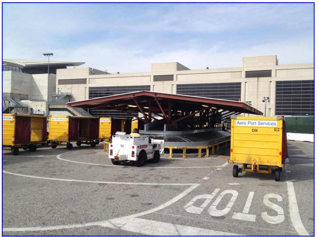
Temporary Interline Carousel Operational