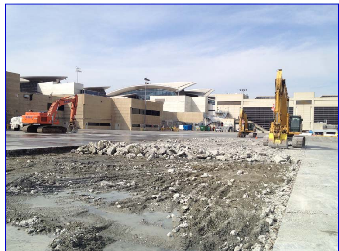
East Apron Demolition Commenced