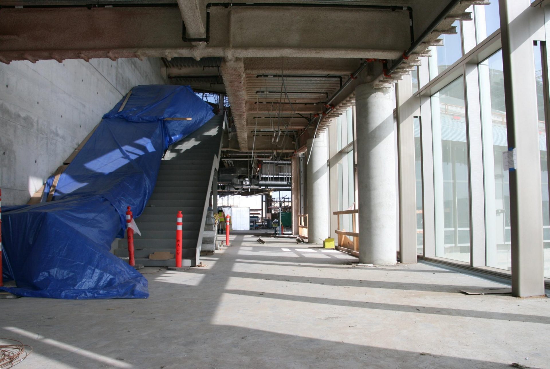
Interior of Gatehouse 134. Escalator (covered) and stairs leading to arrival deck. October 21, 2011