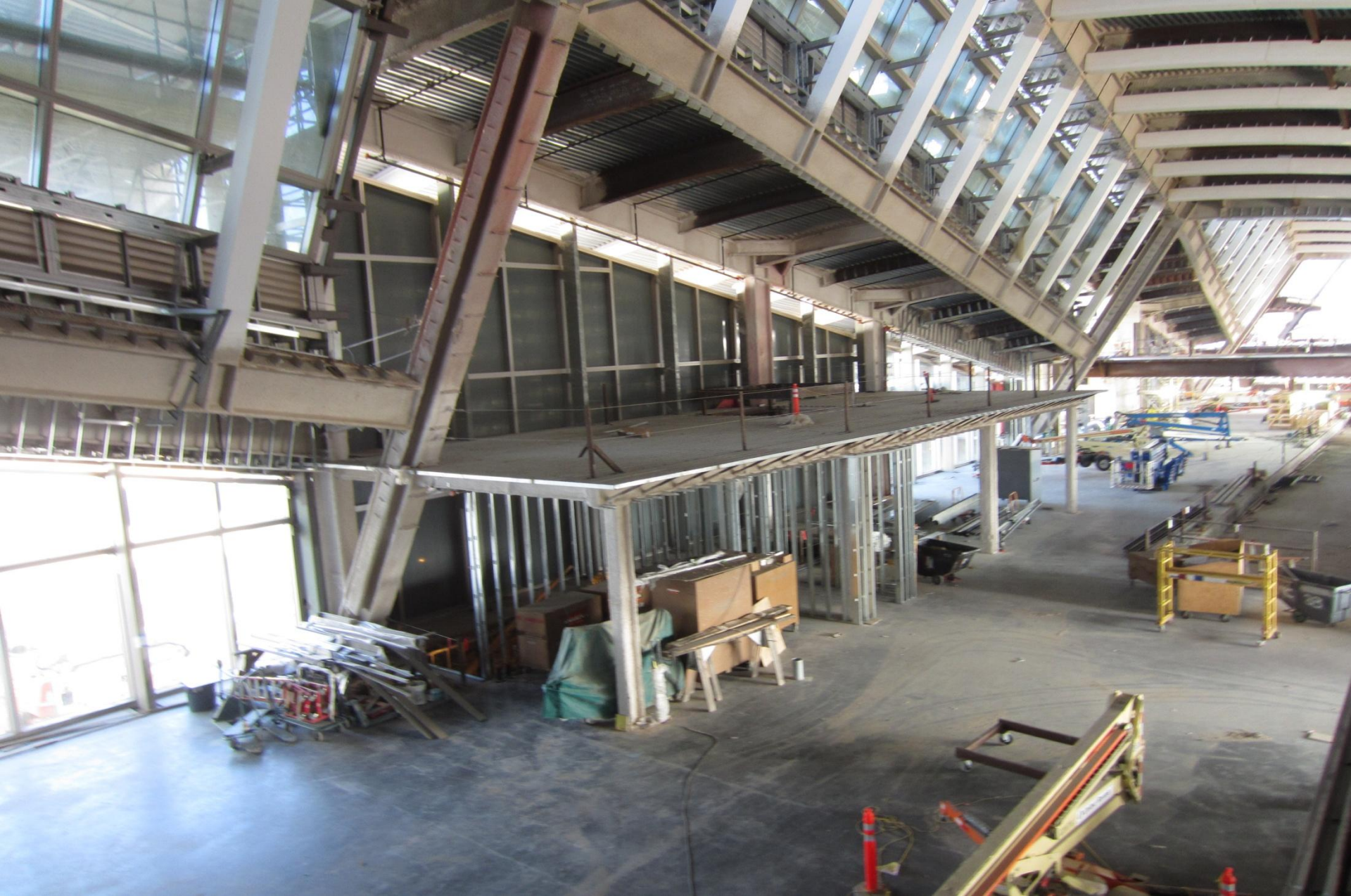
Small concessions area in the middle of the north concourse. October 21, 2011