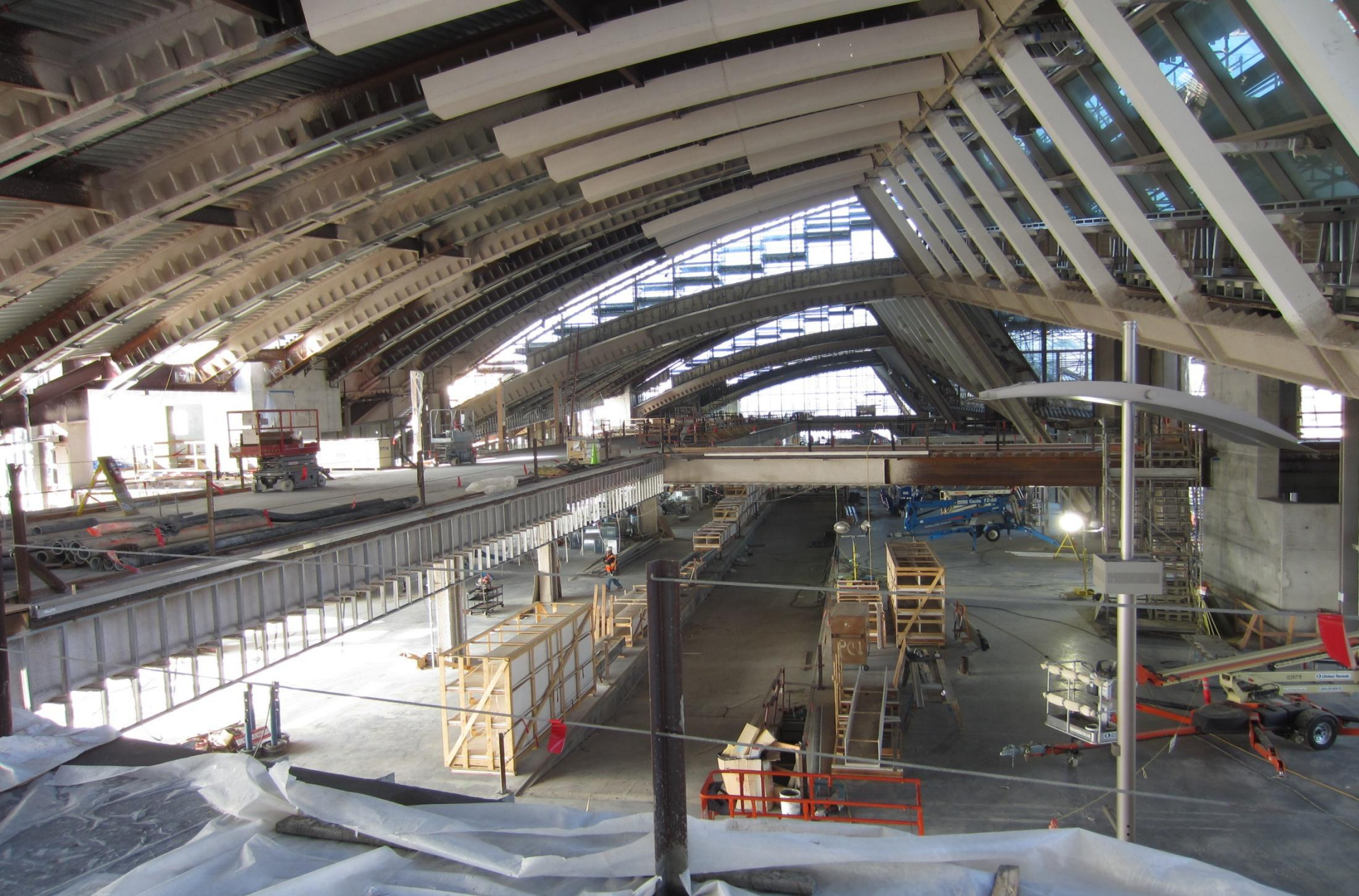
View from the north concourse arrival level looking down to the departure level. The small trench in the middle is for the moving walkway.