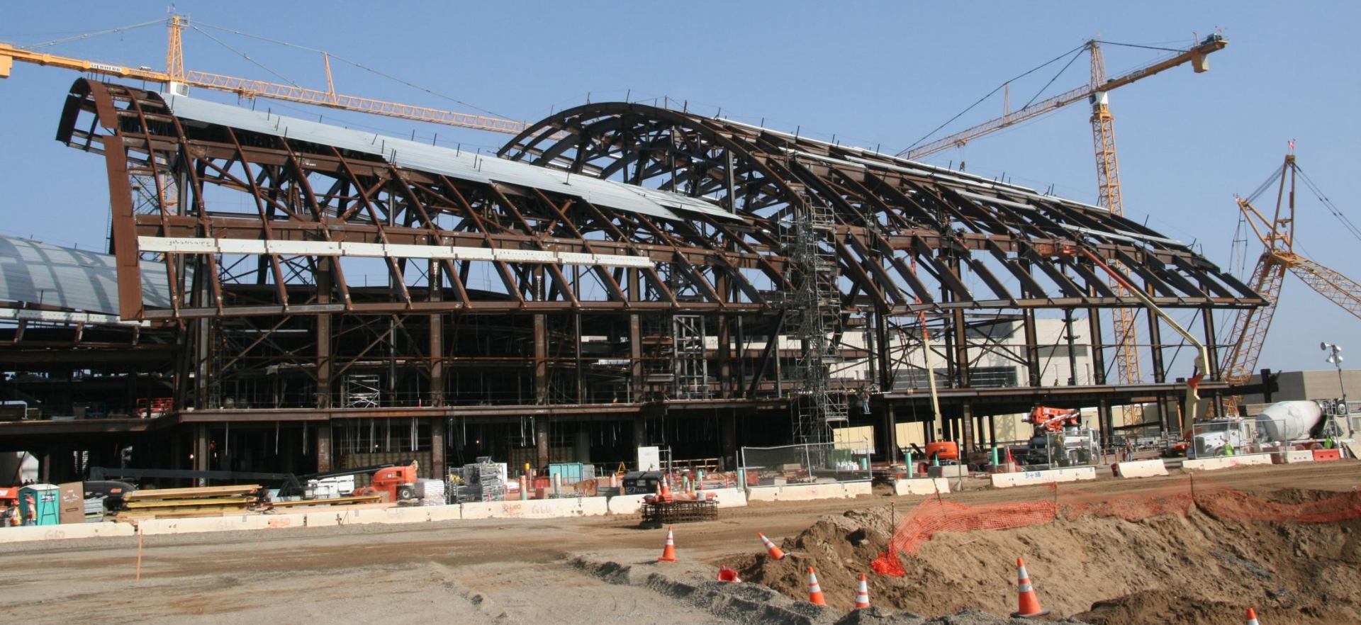
Looking east towards the Bradley West Core (Great Hall). Steel erection for two of the three bays is nearly complete. October 21, 2011