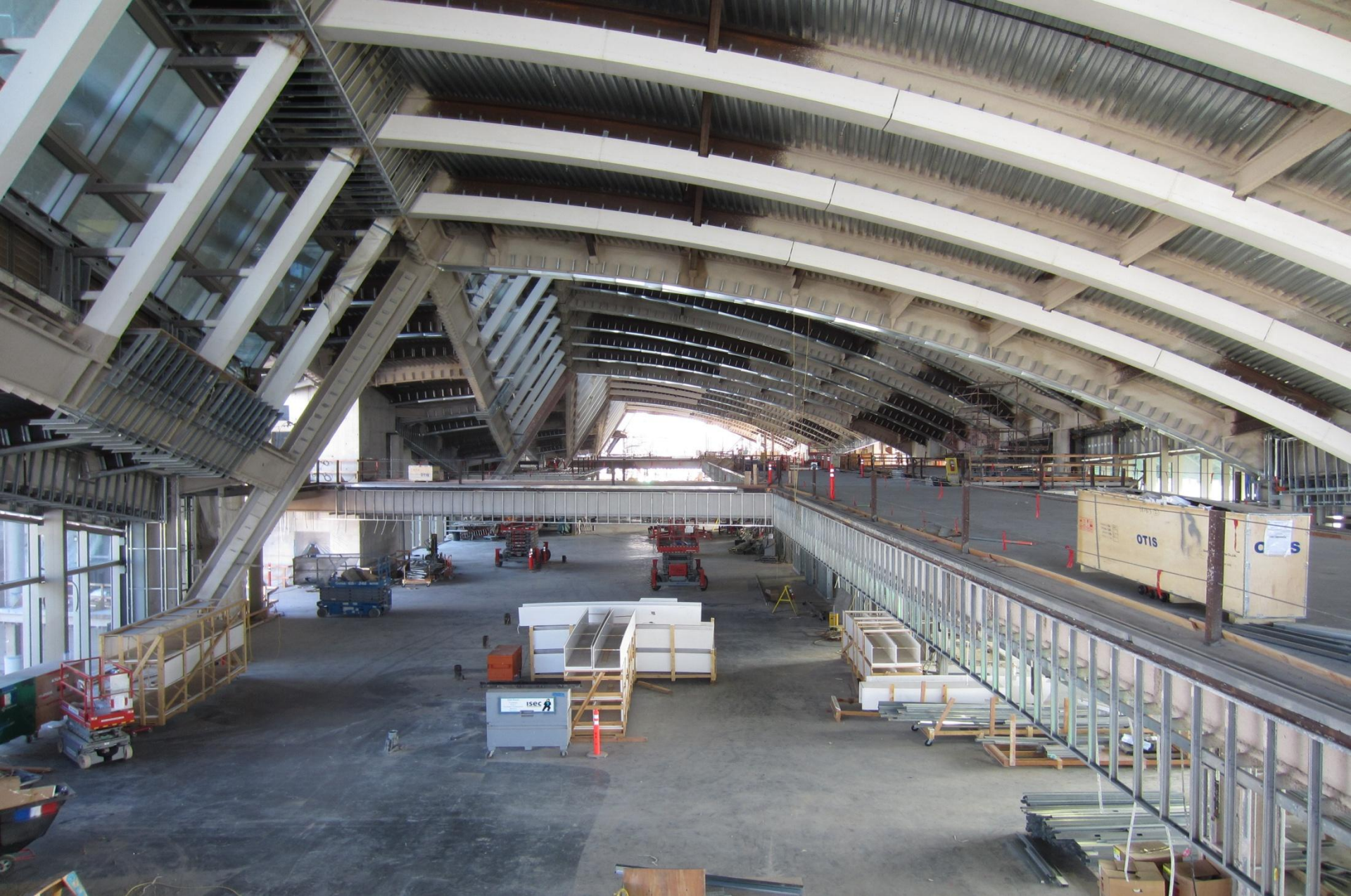
One more view from the north concourse arrivals level looking south. October 21, 2011