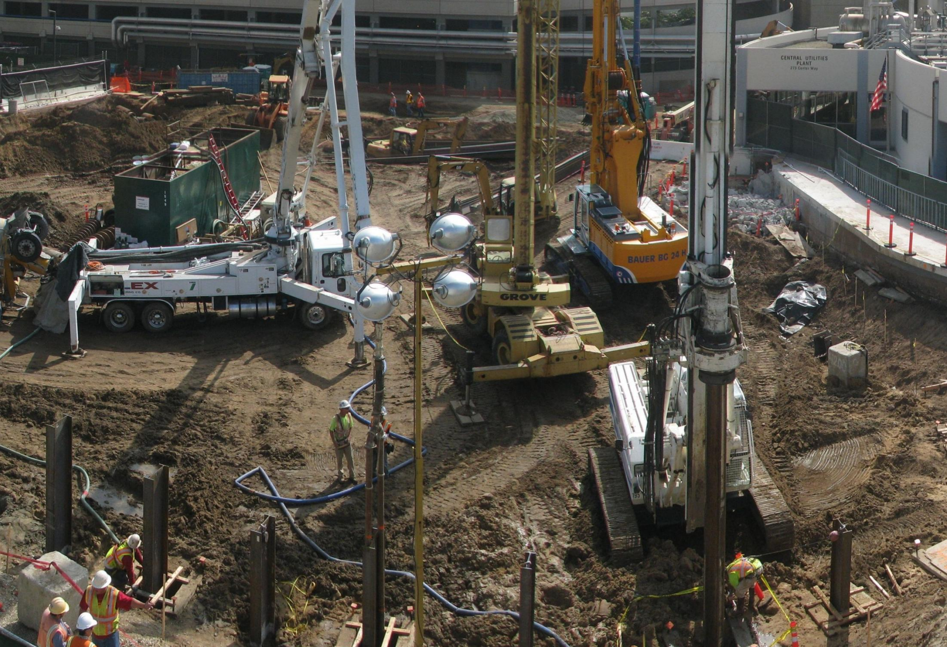
Ongoing construction at the new Central Utility Plant site October 21, 2011