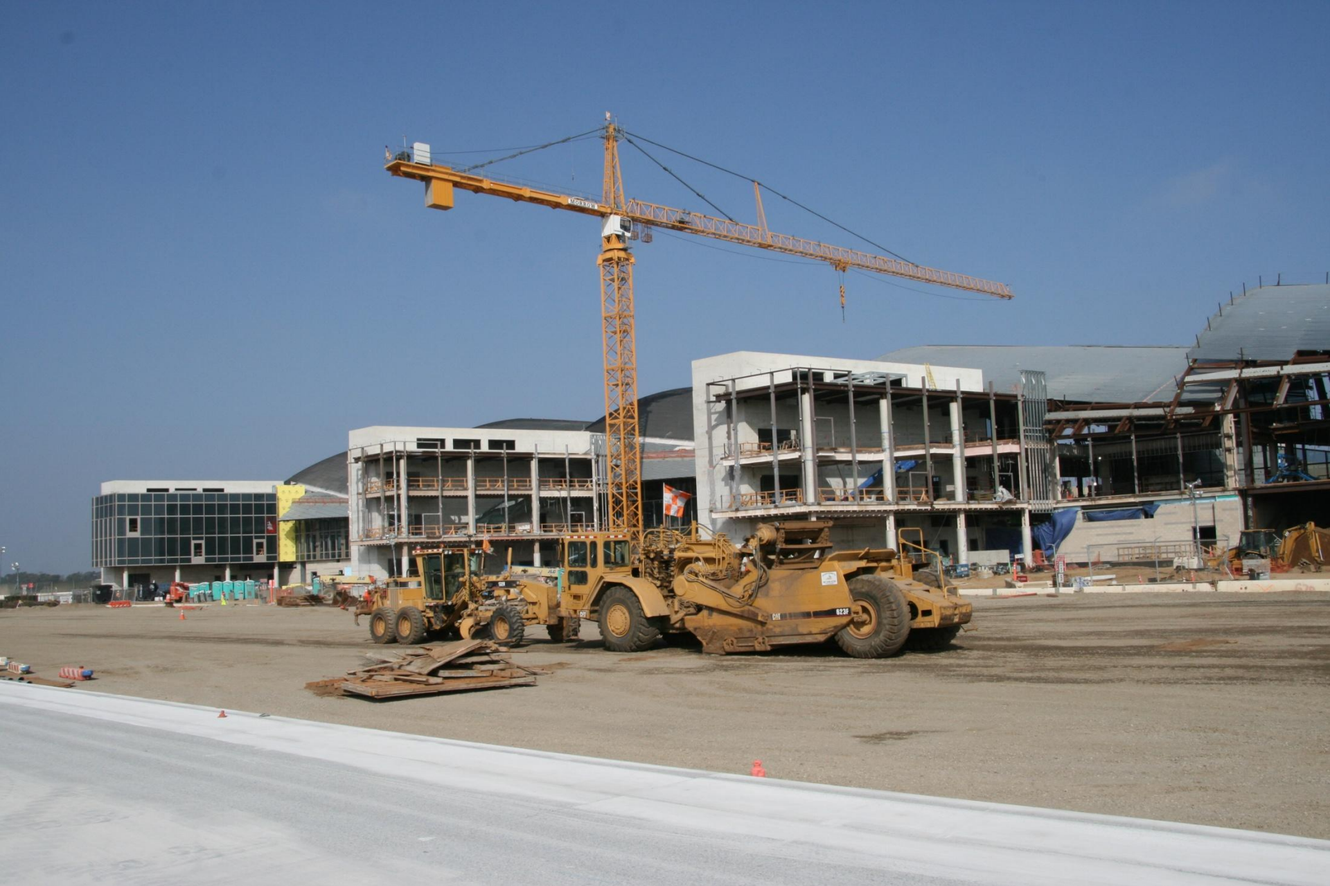
North Gatehouses in various stages of completion. October 21, 2011