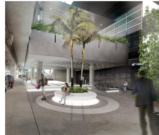
Lower (Arrivals) Level

Various renderings of the new “Front Door” of TBIT when completed.