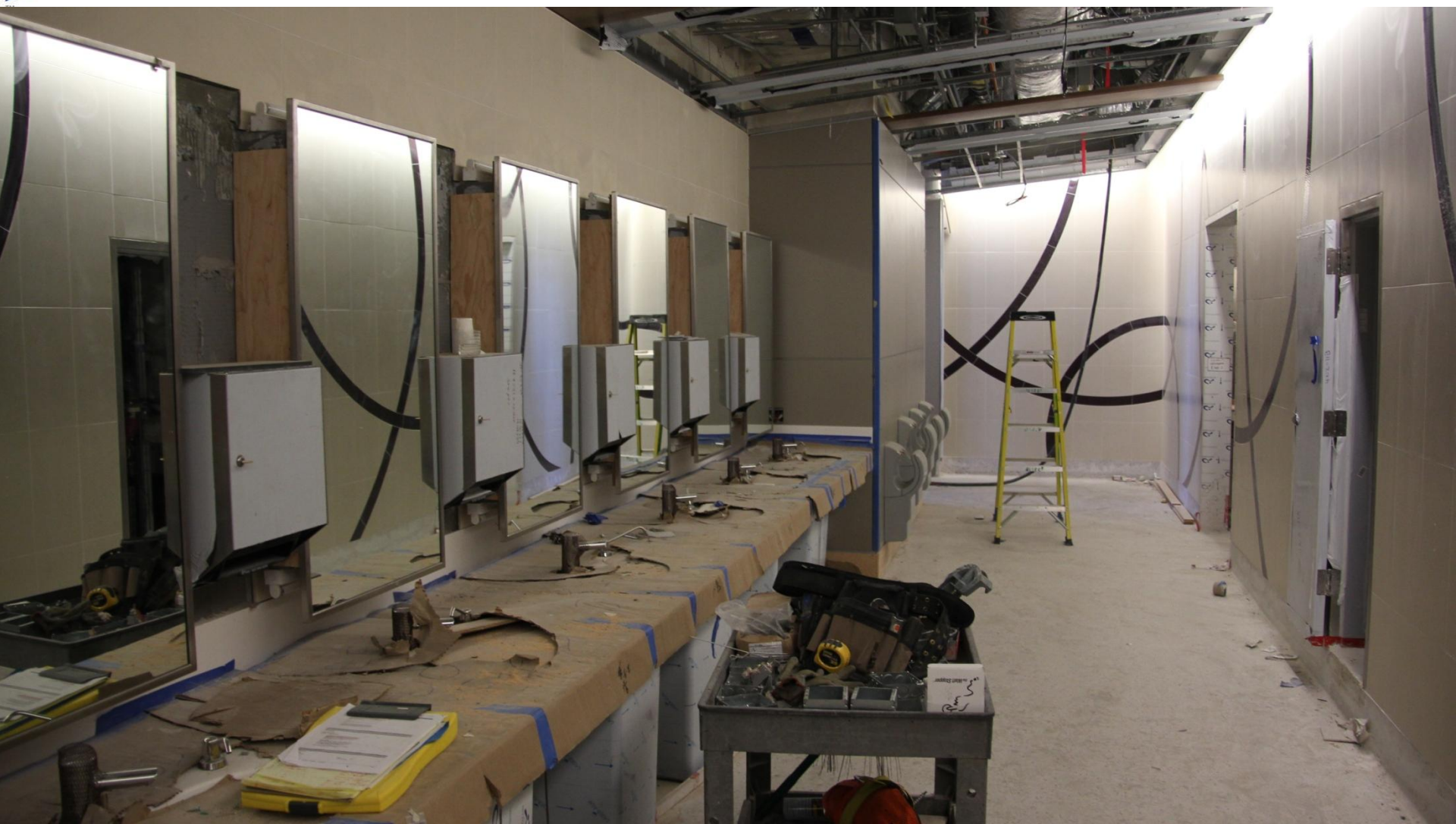
One of the restrooms nearing completion in the north concourse. July 26, 2012