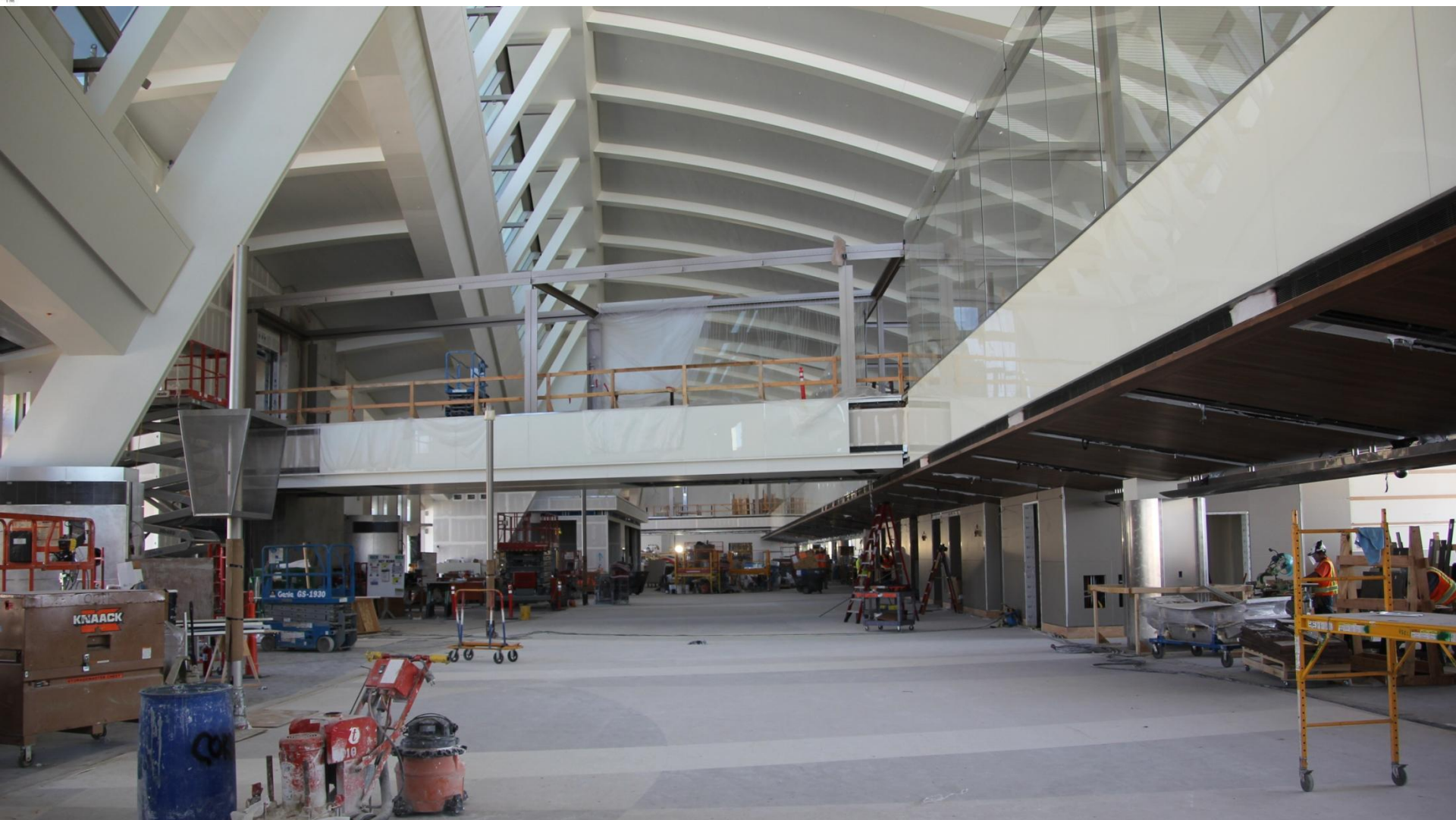
The above ground arrival corridor as seen from the departure level near Gate 134. July 26, 2012