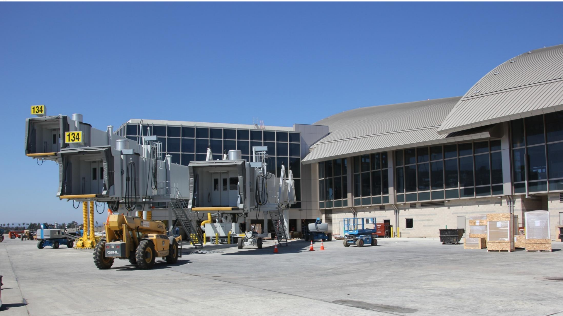
View of the ramp for Gate 134 which will open in September 2012. July 26, 2012