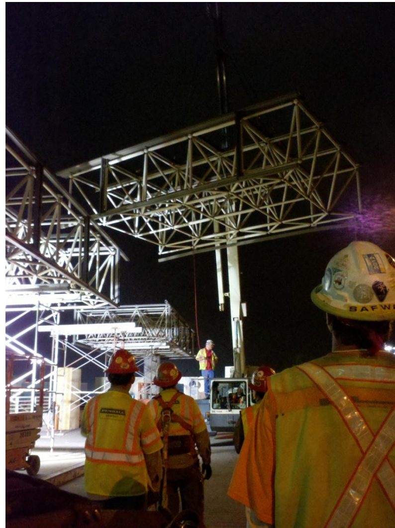
Workers removing the existing glass canopy at the “Front Door” of TBIT (upper level). August 2, 2012