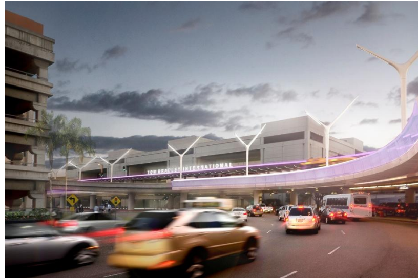
Upper (Departures) Level