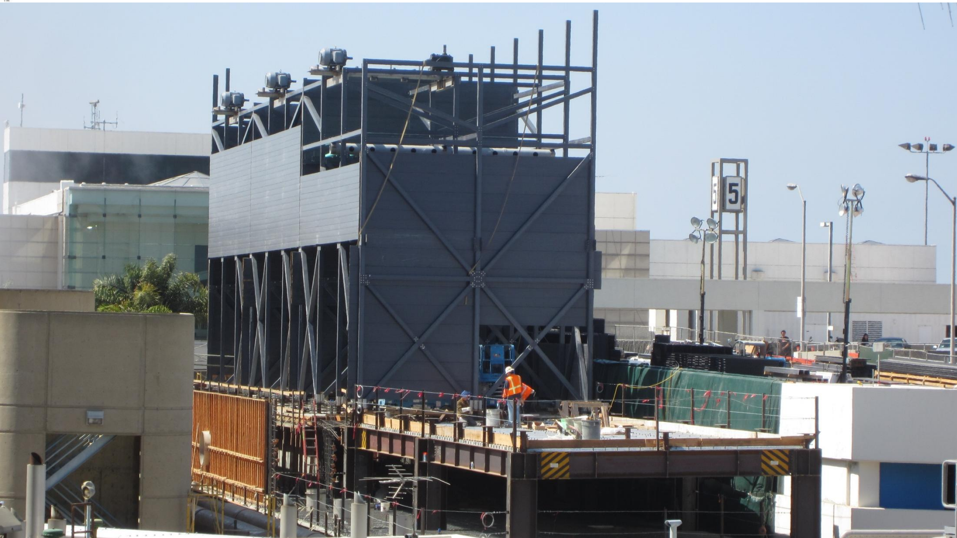
New cooling tower that is part of the CUP project. Between Parking Structures 5 & 6. July 26, 2012