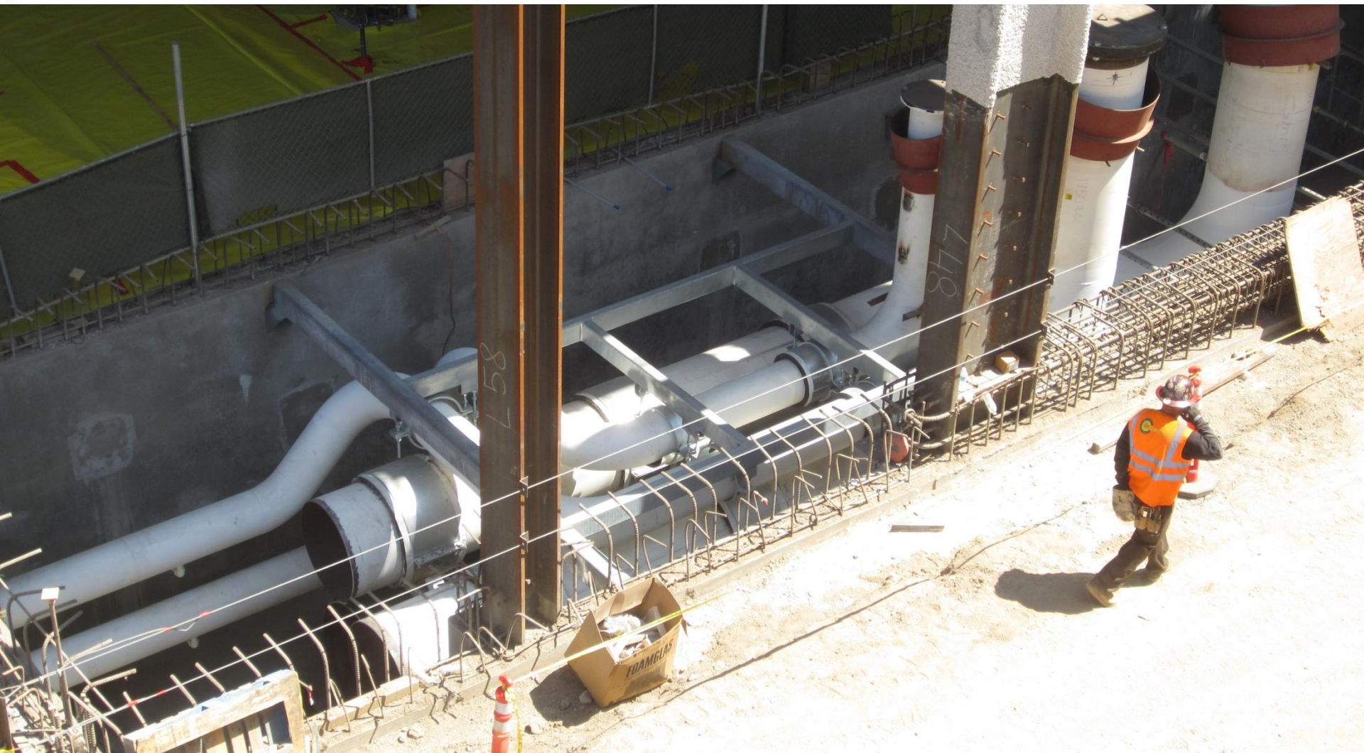
Some of the large underground utility distribution piping for the new CUP. July 26, 2012