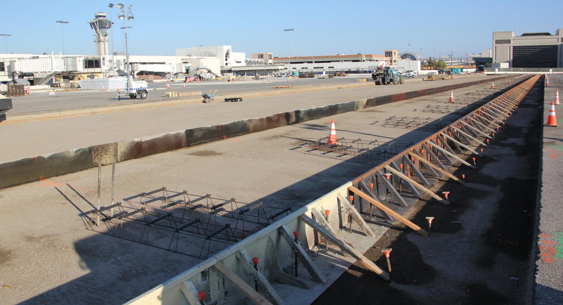
Reconstruction of the centerline portion of Taxilane D10 between Terminal 3 and TBIT. July 26, 2012