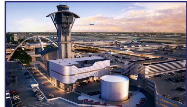
Exterior of the new Central Utility Plant (CUP). July 26, 2012