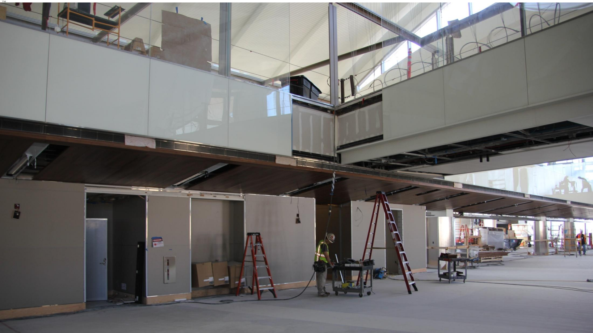
North concourse departure level. Workers are putting the final touches on the interior. July 26, 2012