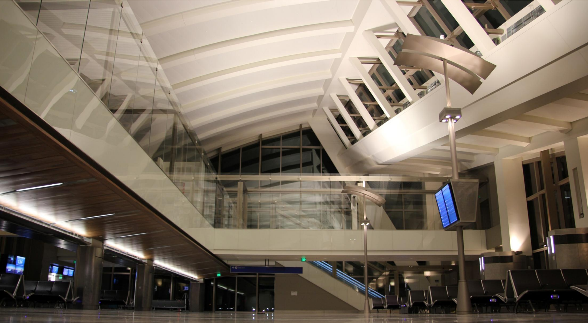
Departure Lobby – Gate 134 August 29, 2012