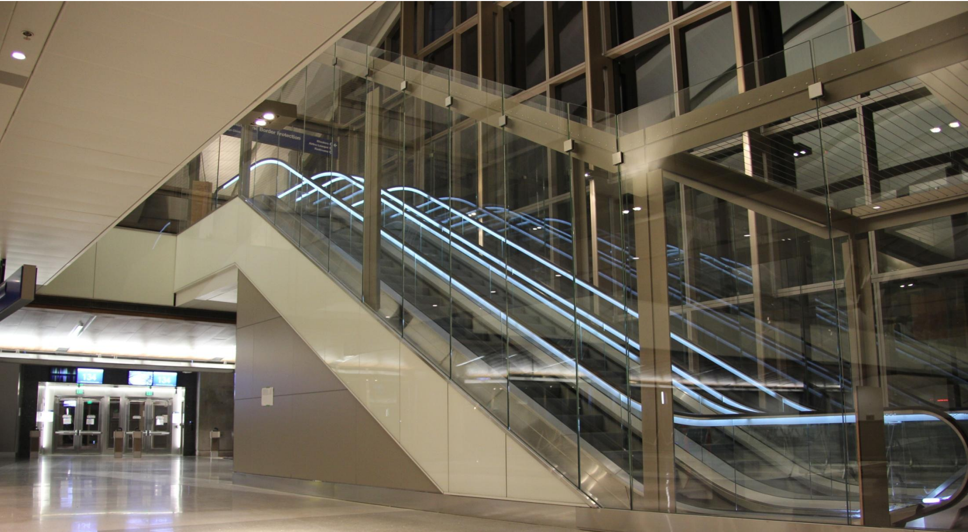
Escalator to Customs – Gate 134 August 29, 2012