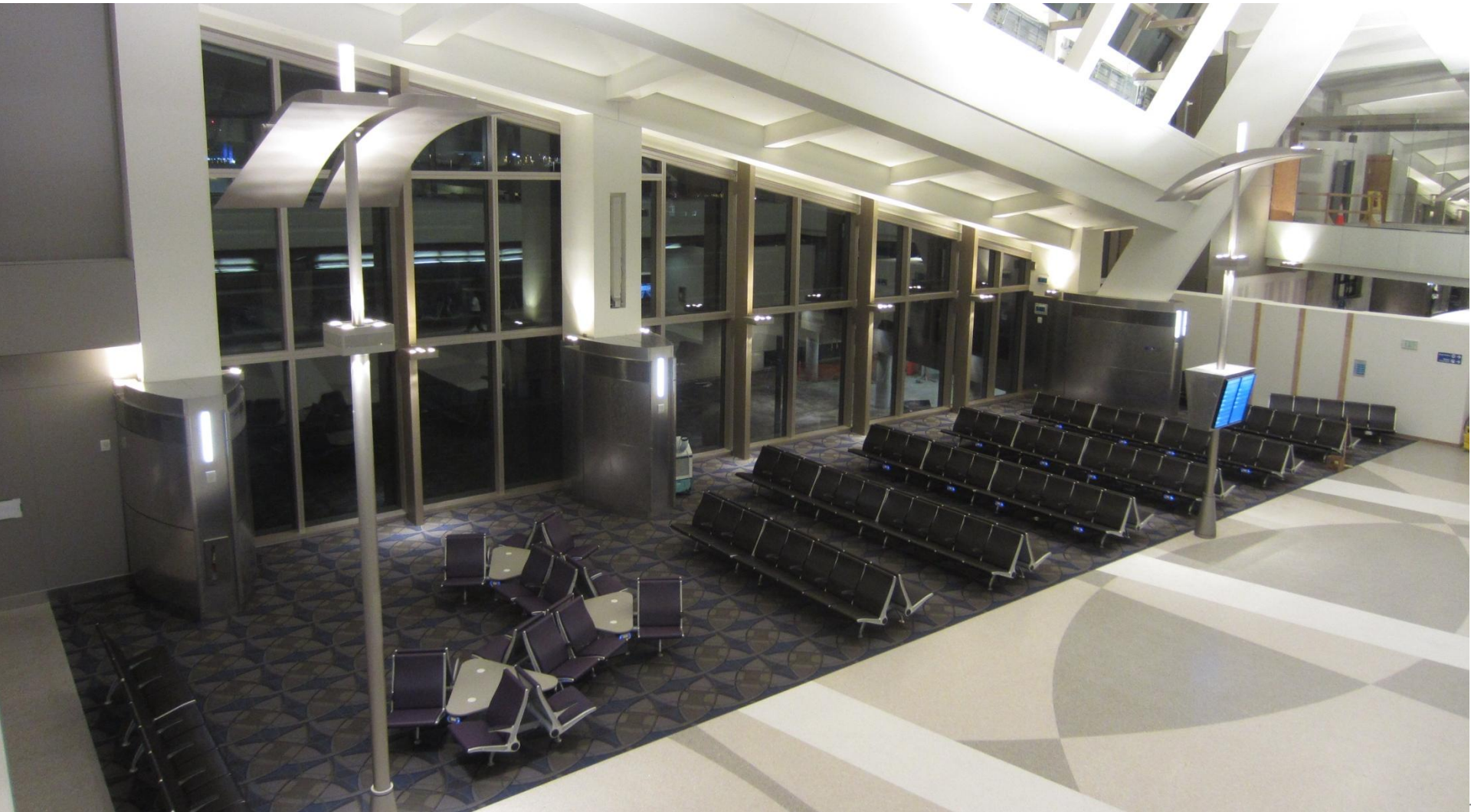
View of departure level from arrival corridor – Gate 134 August 29, 2012