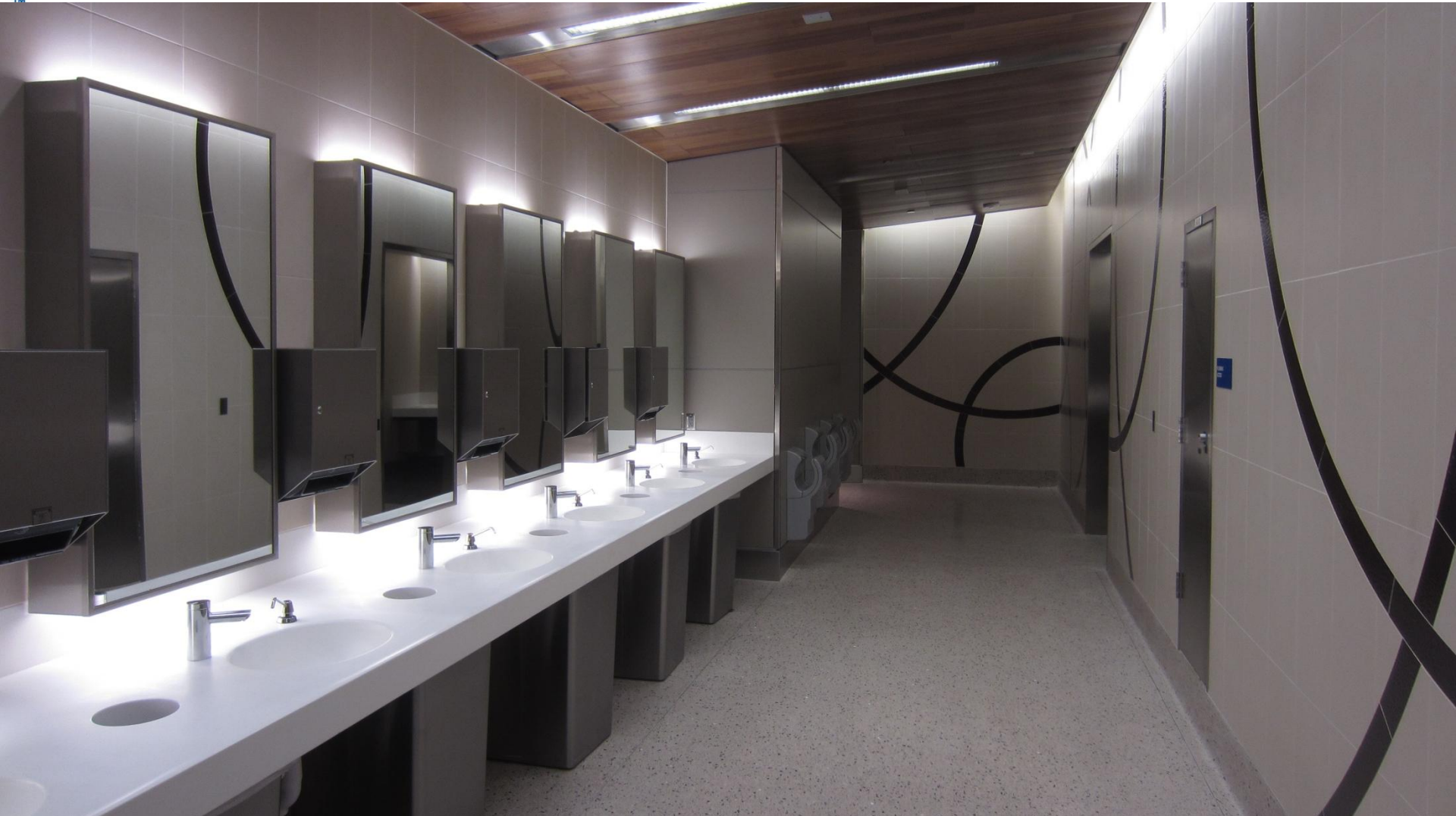
Restroom interior August 29, 2012