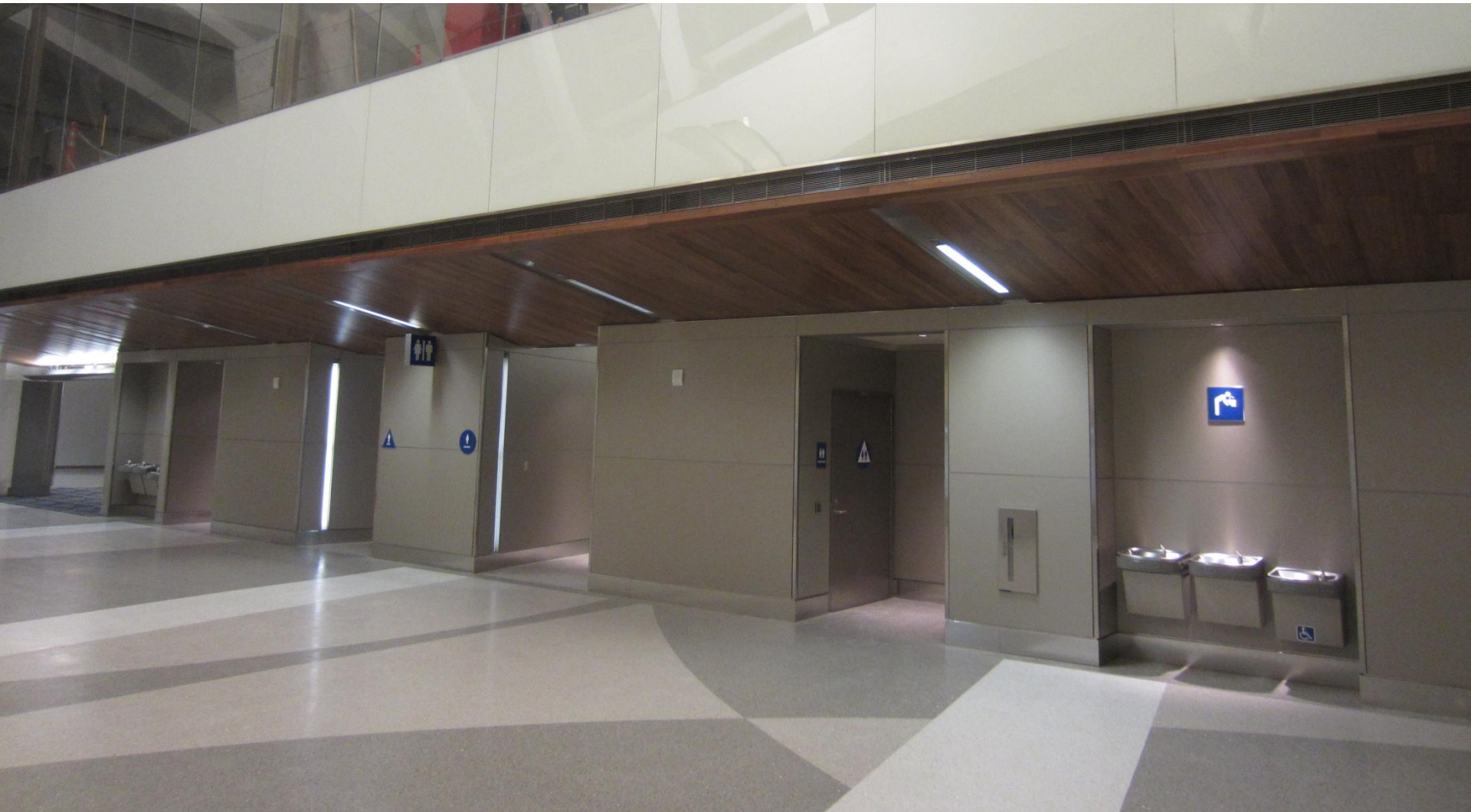
Restroom exterior August 29, 2012