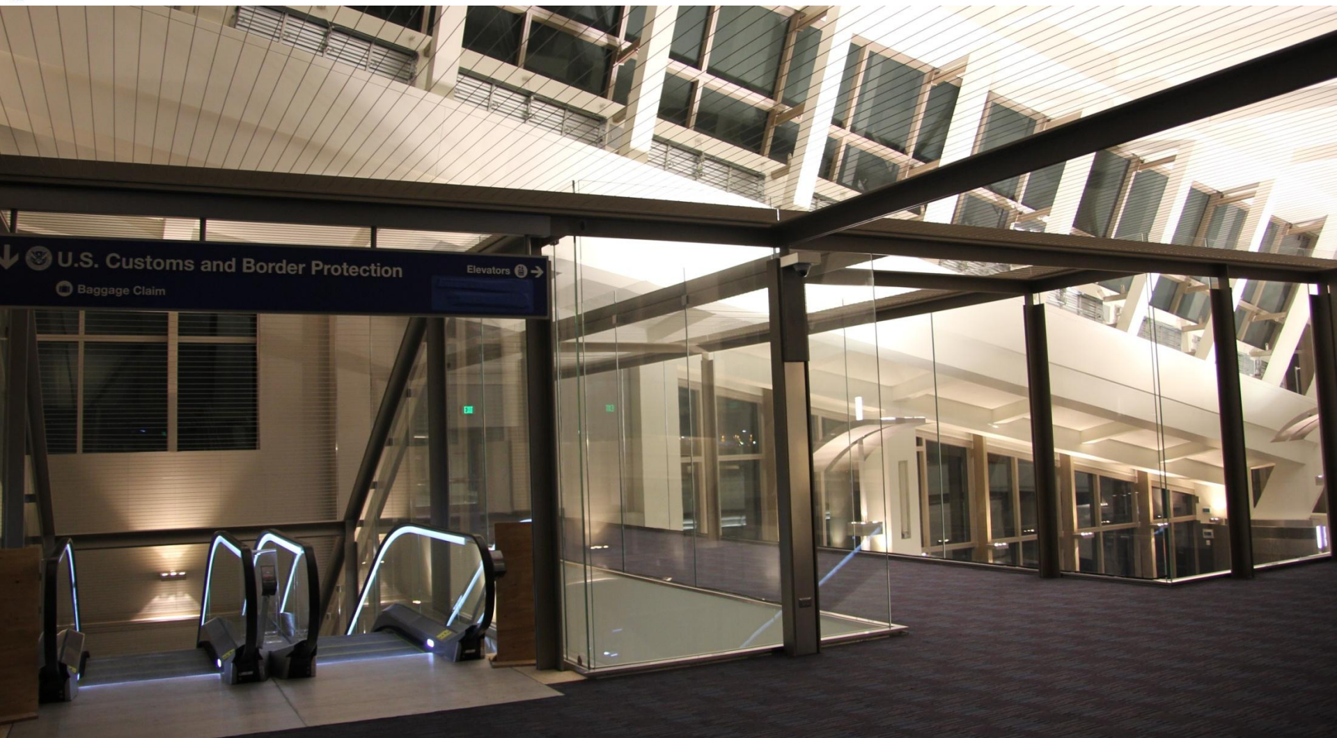
Arrival Corridor – Gate 134 August 29, 2012