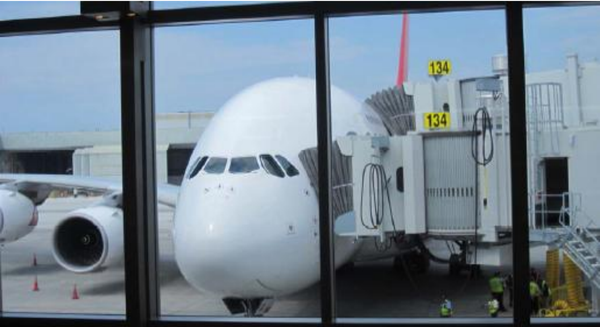
First gate fit for Airbus A380 August 17, 2012