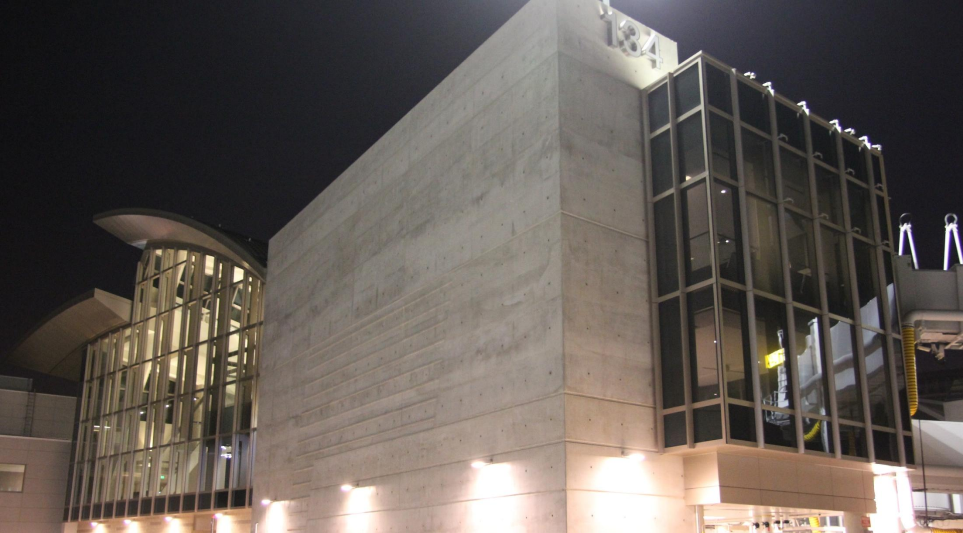
Gate 134 Exterior August 29, 2012