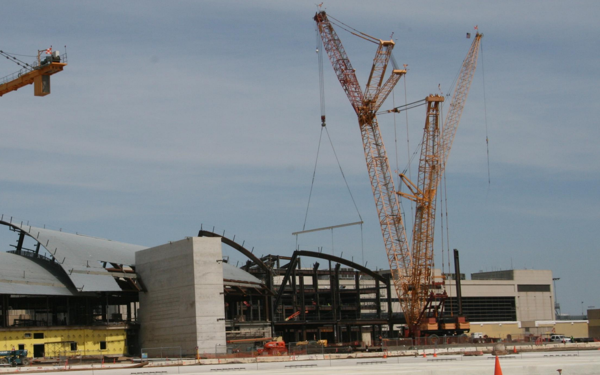
Large crawler crane lifting a large support beam into place on the core. (June 3, 2011)