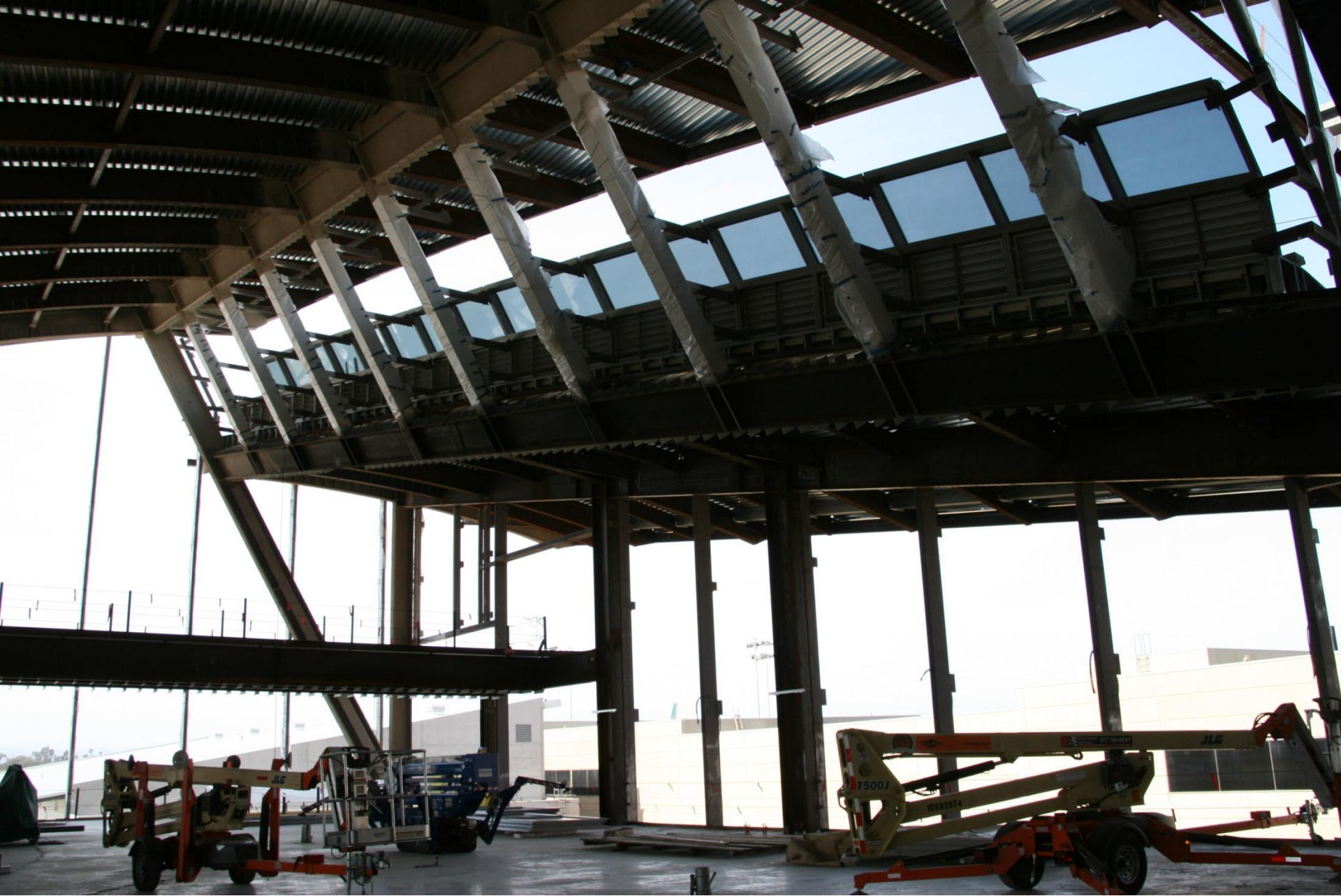
Glazing (glass windows) are now being installed in the north concourse. (June 3, 2011)