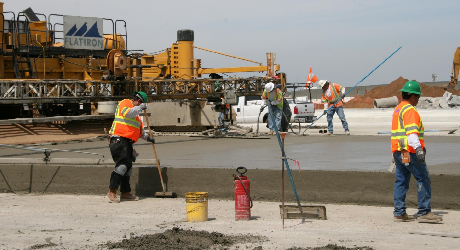
Concrete slab for Taxilane S being poured. Note the thickness of the concrete slab (19"), plus 12" cement-treated base and 6" crushed miscellaneous base underneath slab for a total thickness of 37". Taxilane S will open mid-summer. (June 3, 2011)