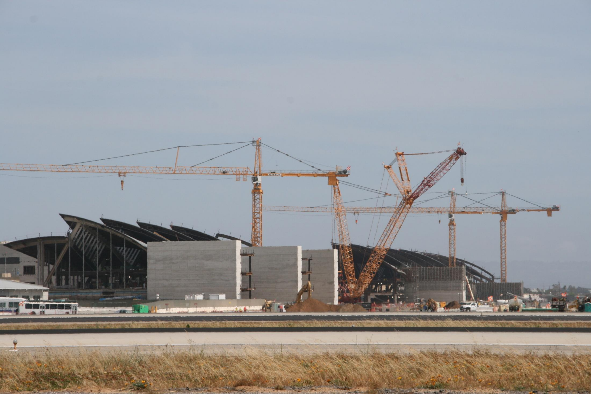
The crawler cranes used to erect steel for the concourses have now been replaced by several tower cranes. Crawler cranes are now lifting steel for the core. (June 3, 2011)