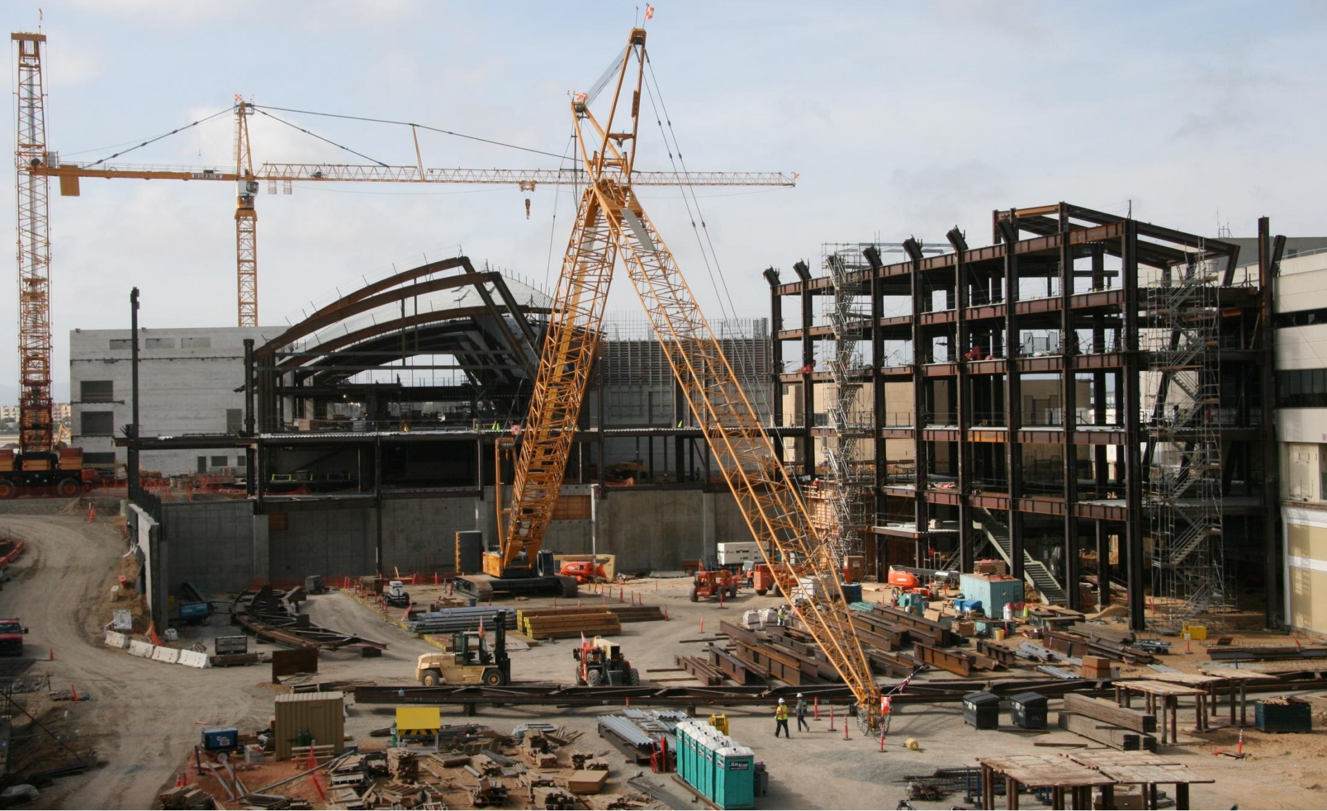
Core construction. Steel erected on the backside of TBIT for office and lounge areas. Large crawler cranes used to hoist core steel into place. (June 3, 2011)