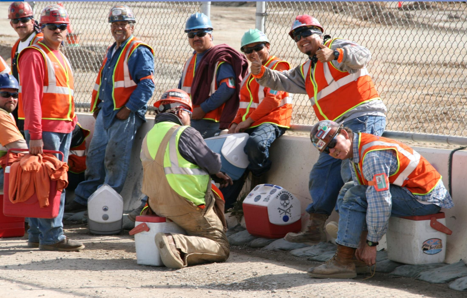
Some of the thousands of contractors working on the LAX Development Program. (June 3, 2011)