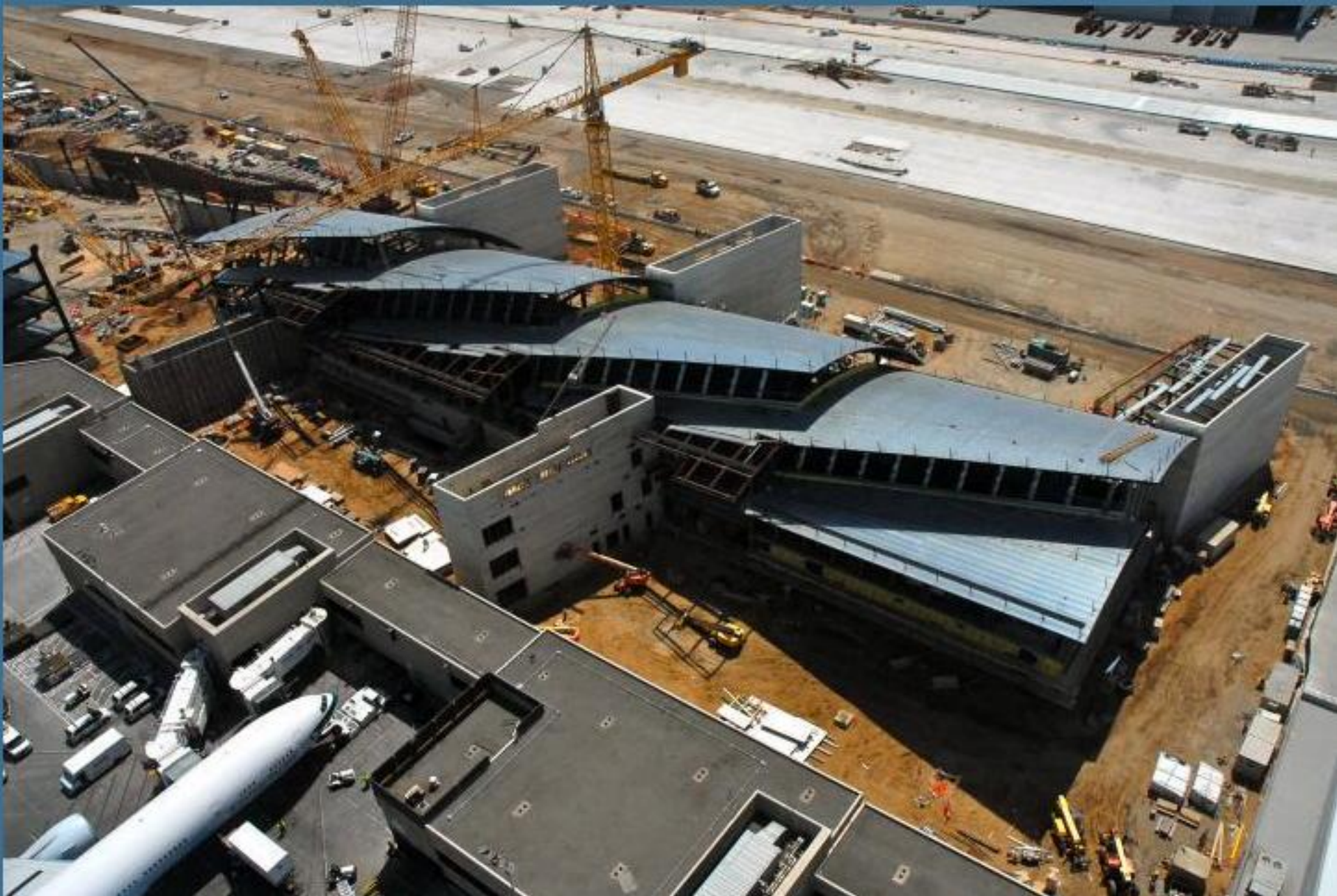
Aerial view showing proximity between gatehouses for the Bradley West north concourse and current TBIT north concourse. (May 24, 2011)