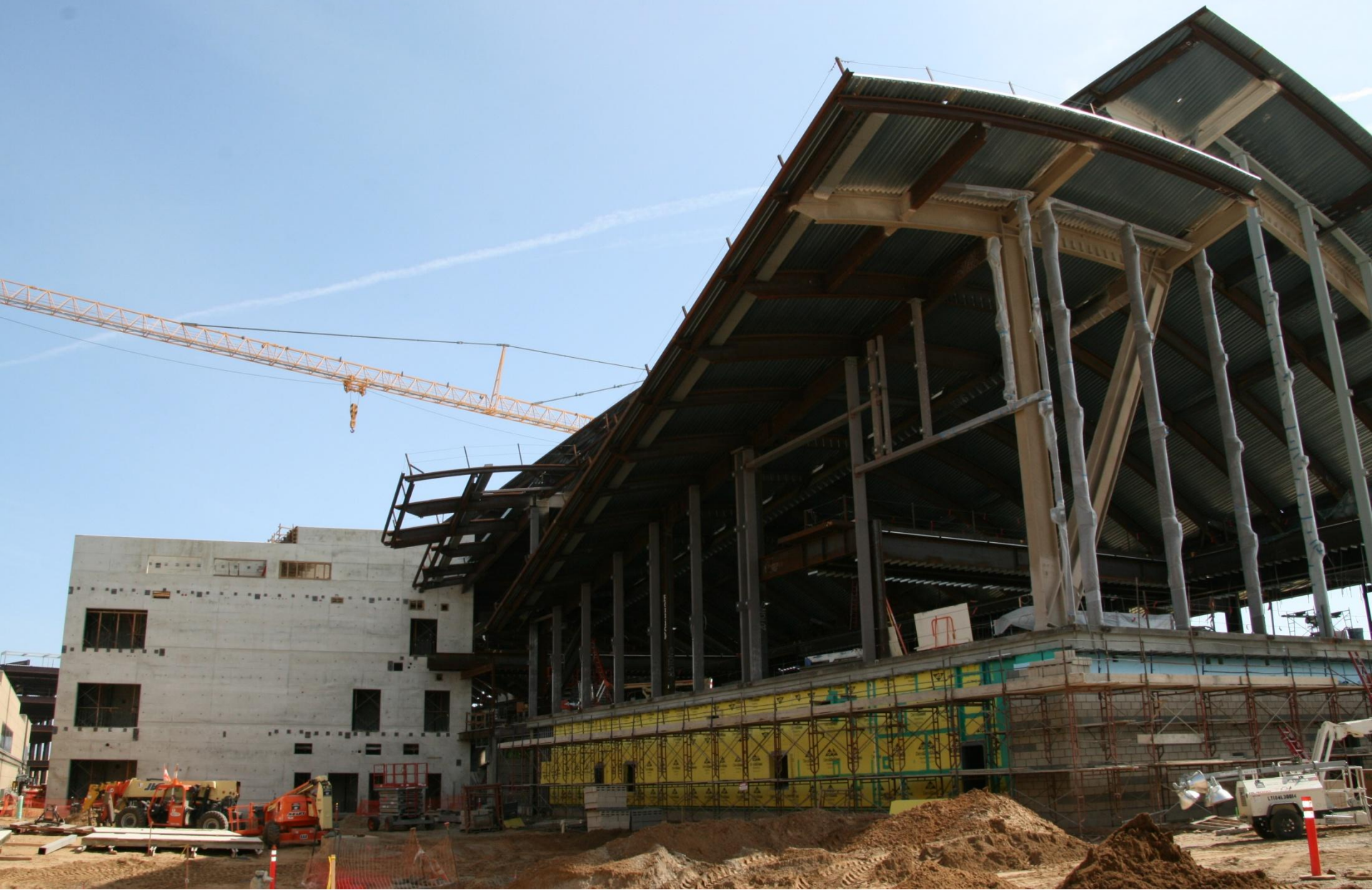
East side of north concourse. Gatehouses for the east side of Bradley West are under construction only several feet away from the back wall of TBIT. (June 3, 2011)