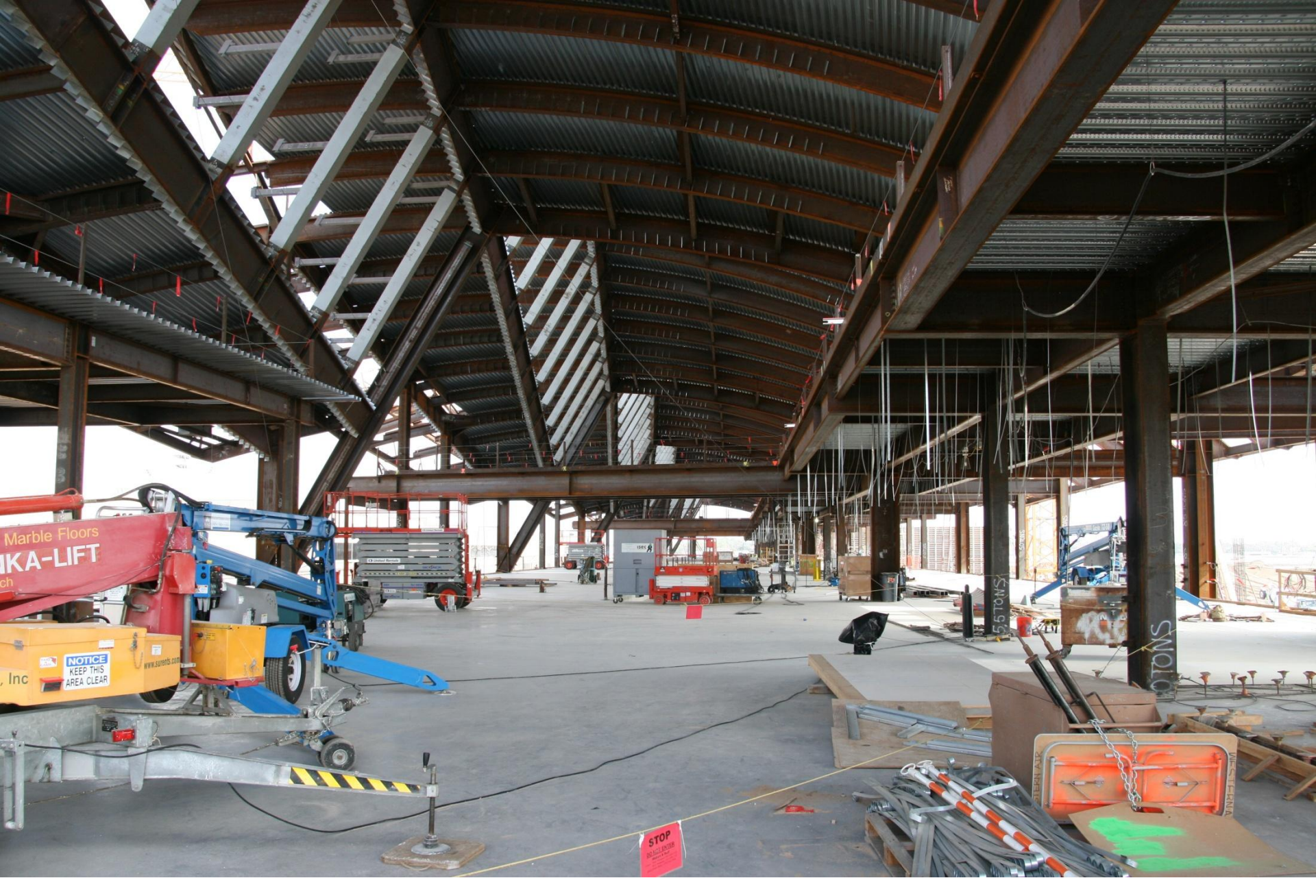
Departure level of south concourse. (June 3, 2011)