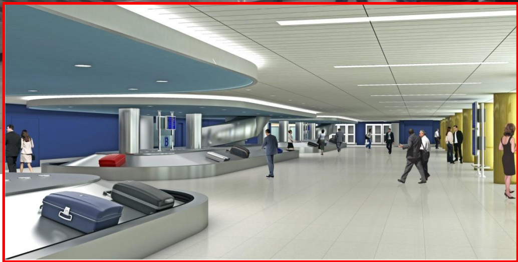
New baggage claim for Terminal 6. (June 6, 2011)