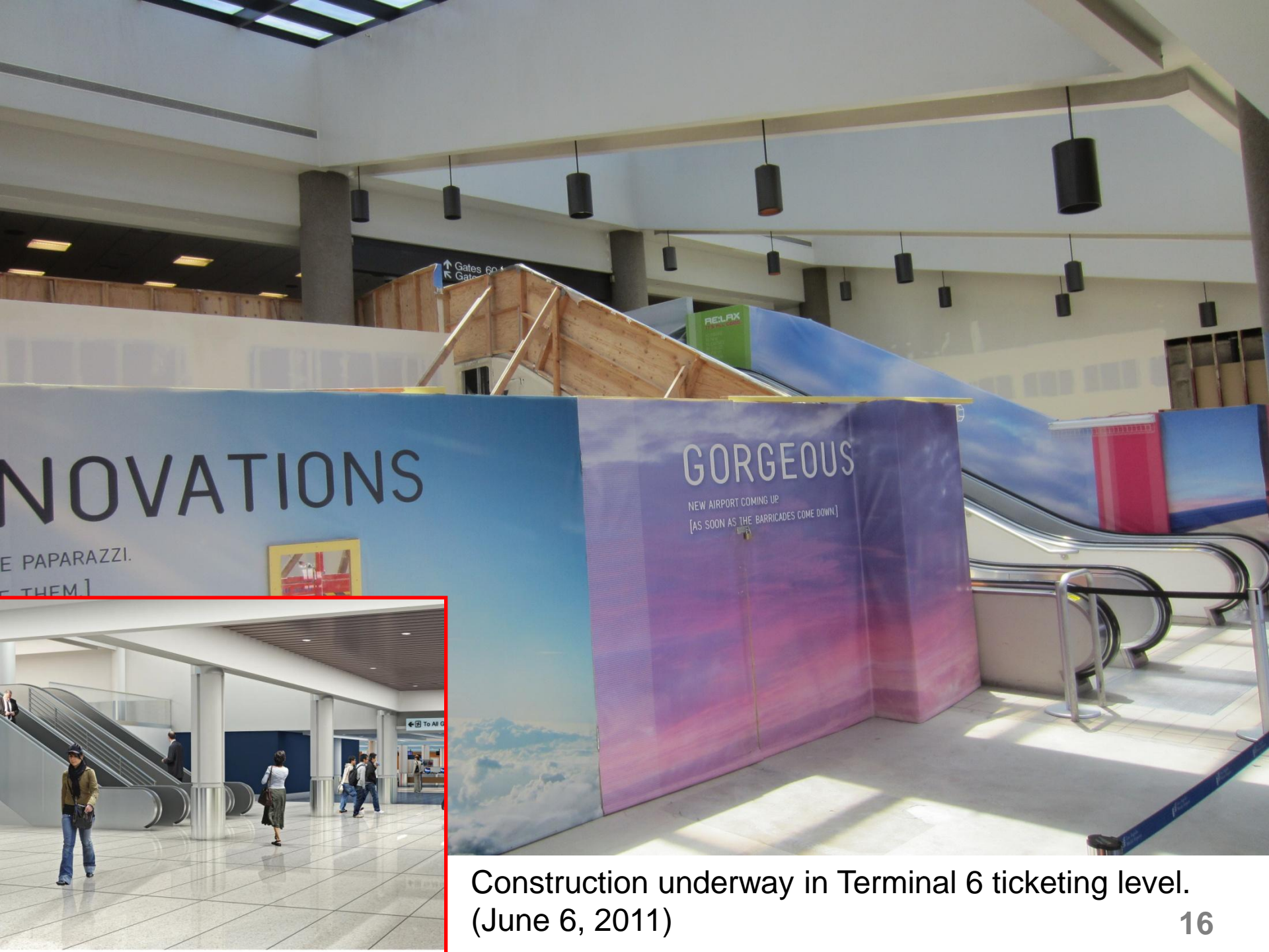
Construction underway in Terminal 6 ticketing level. (June 6, 2011)