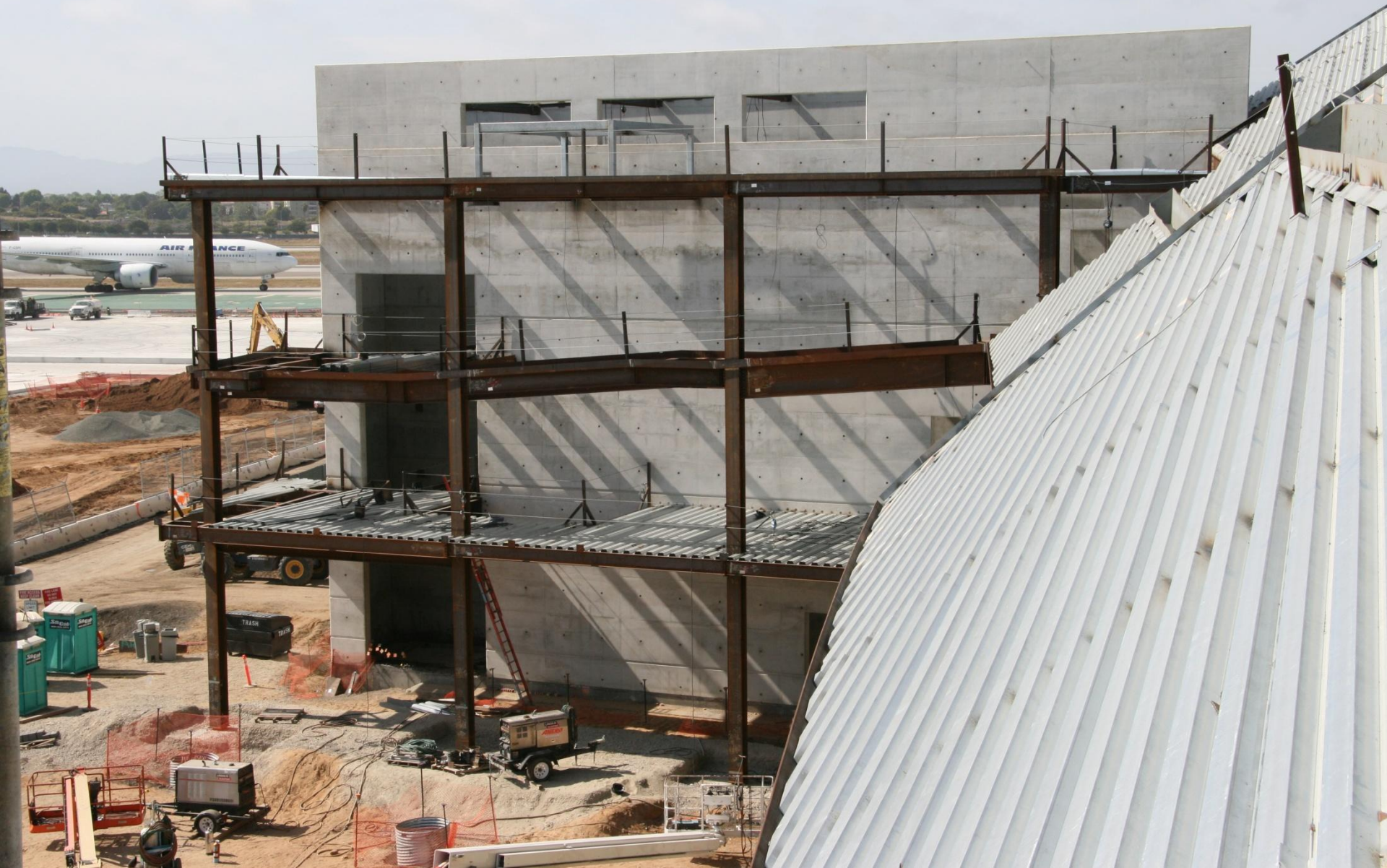
One of the gatehouses for the north concourse. Glass walls will encase the gatehouses for a very open and airy look for the passengers entering/exiting aircraft. (June 3, 2011)