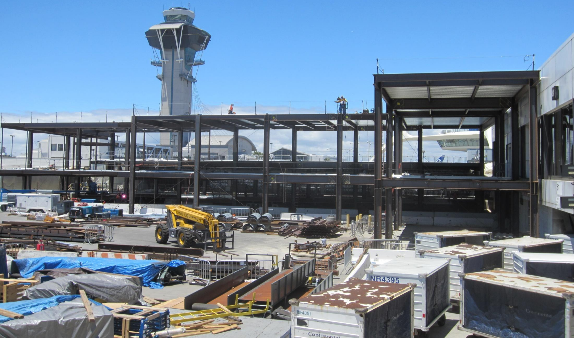
New screening and security checkpoint area under construction at Terminal 6. (June 6, 2011)