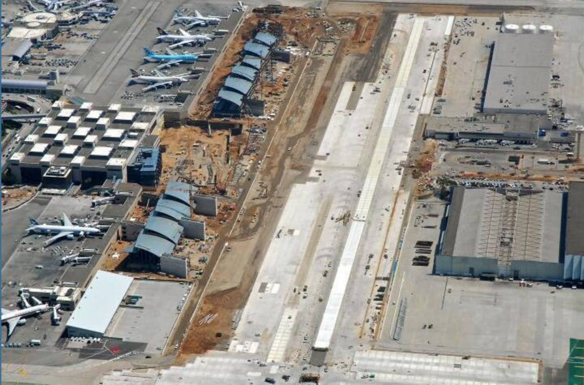
Aerial view of Bradley West and Taxilane S. (May 24, 2011)