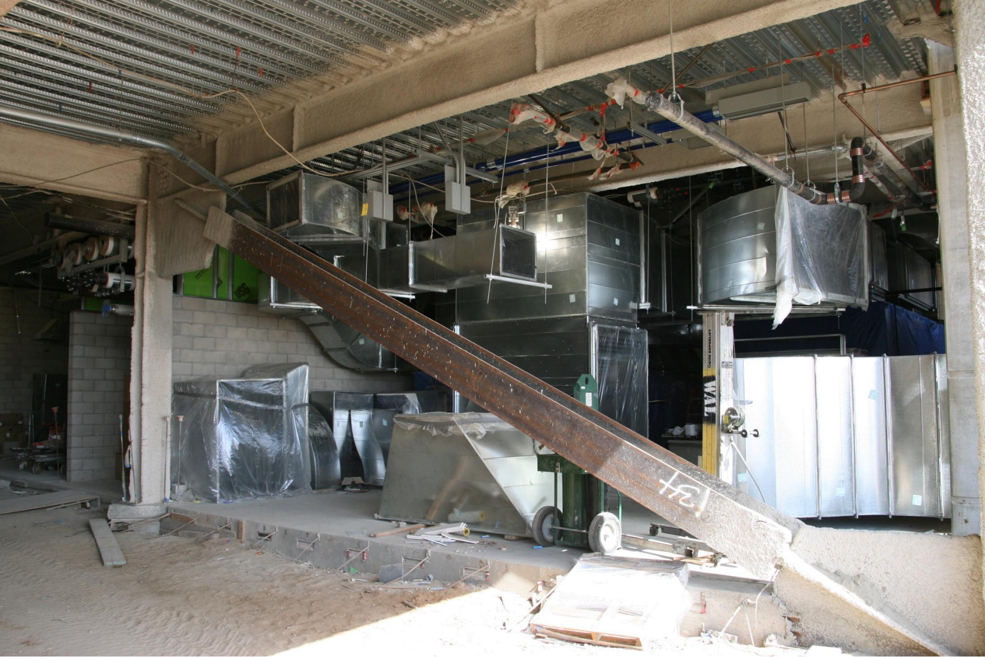
Heating, Ventilation, and Air Conditioning (HVAC) system located on the ramp level of the north concourse. (June 3, 2011)