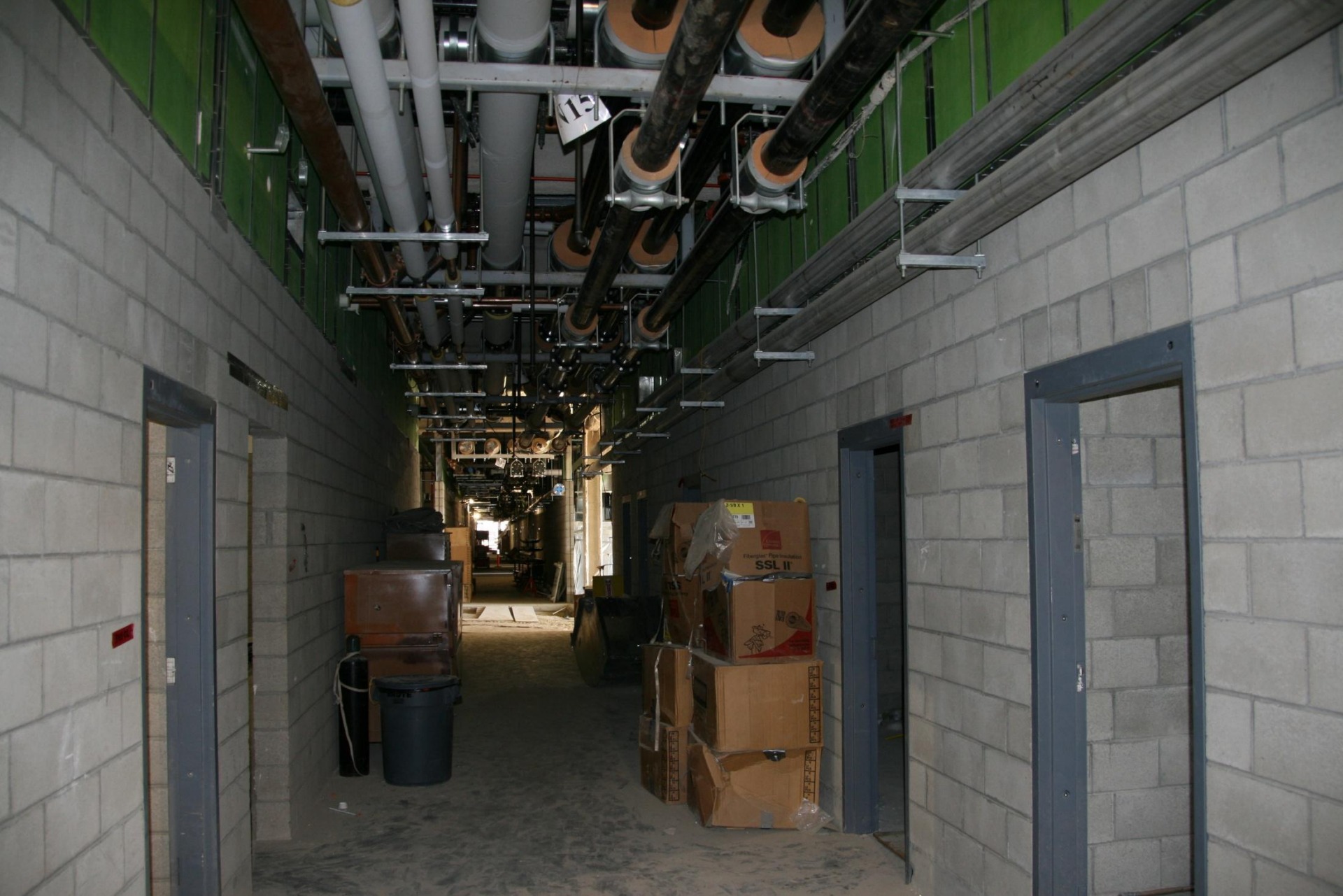
Ramp area offices and utilities for the north concourse. (June 3, 2011)