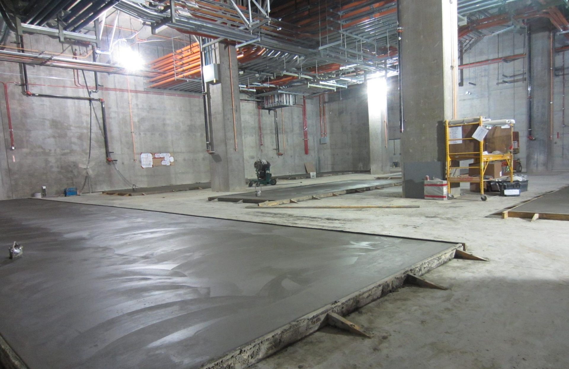
North concourse basement where the utility rooms will be. Piping, conduit, and concrete pads for equipment are visible.