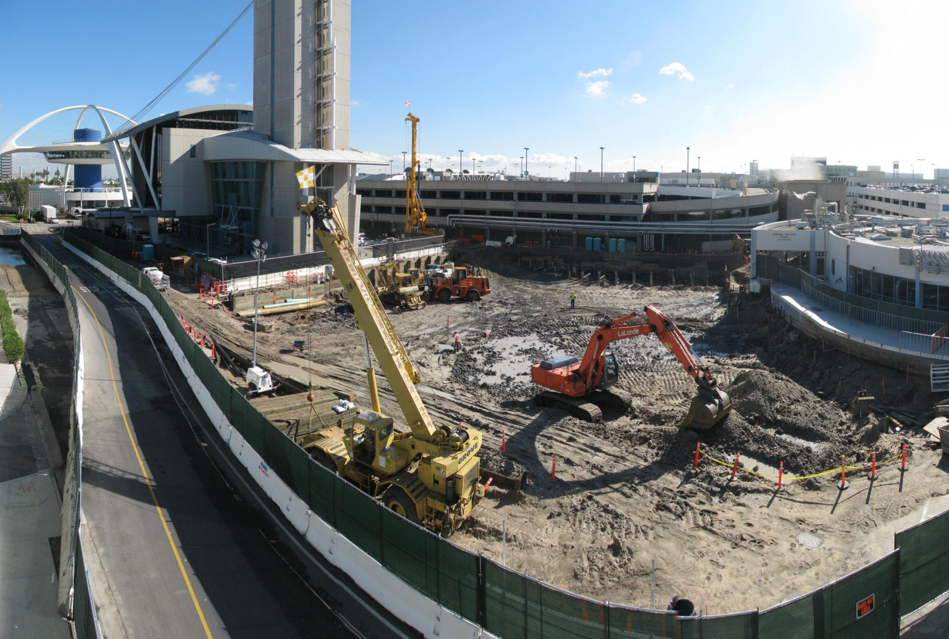
View of CUP construction site from top of Parking Structure 2. November 21, 2011