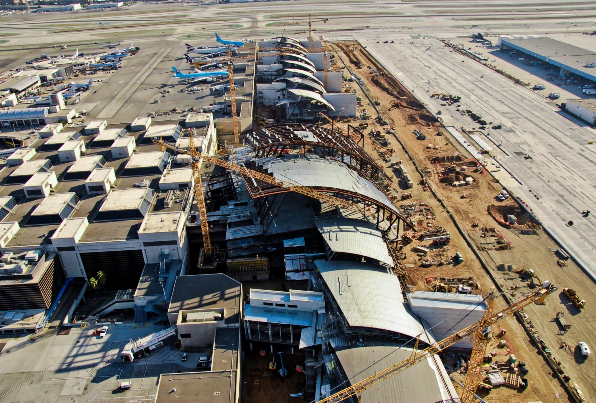
Aerial view of Bradley West and Taxilane S. October 28, 2011