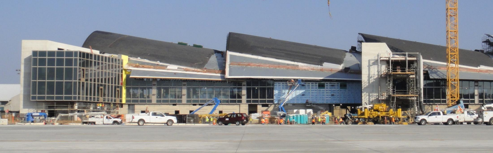
Gates 134 and 132.