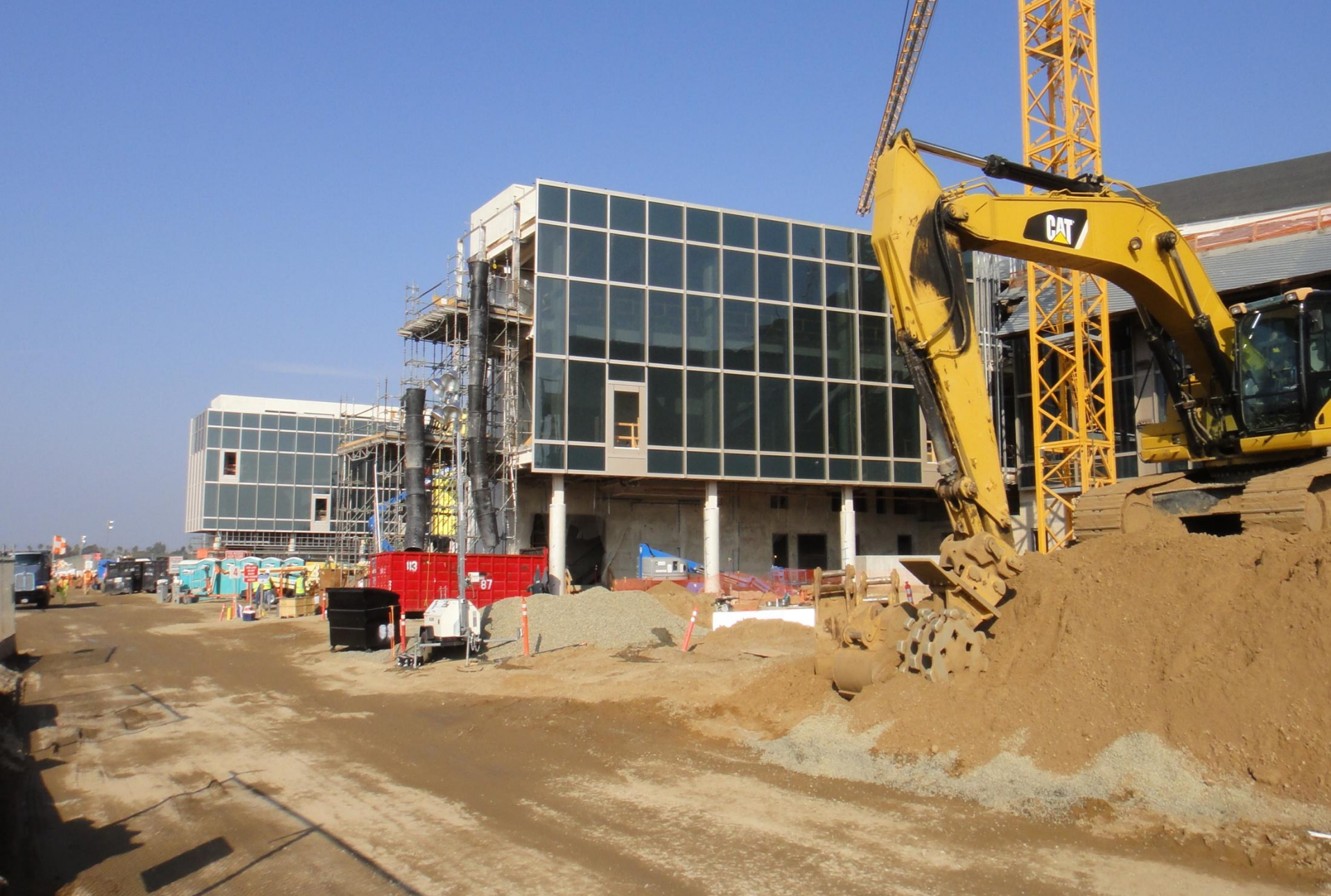
Glass curtainwall being installed on Gates 134 and 132. November 15, 2011