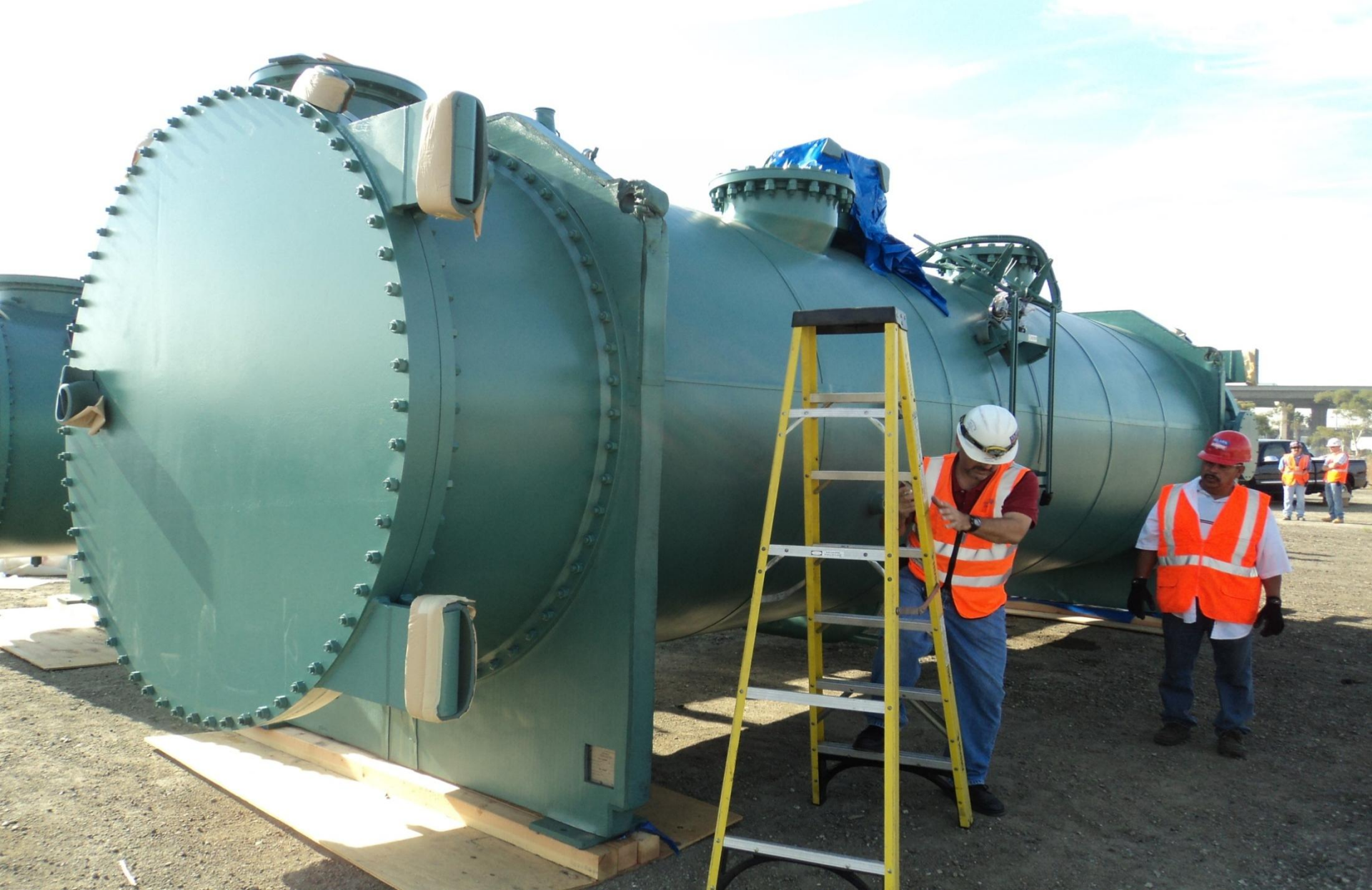
Chiller equipment for new CUP arriving on site. There will be 7 chillers with two cylinders in each chiller (one evaporator and one condenser) for a total of 14 cylinders. November 2011