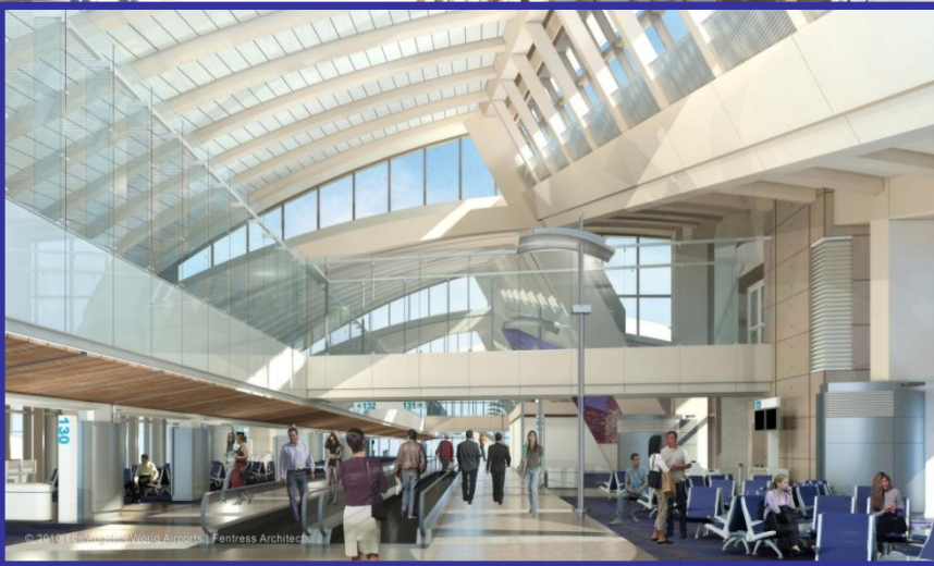
North concourse departure level. October 21, 2011