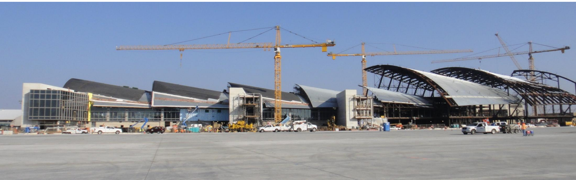
Gates 134, 132, 130, and Core. November 15, 2011