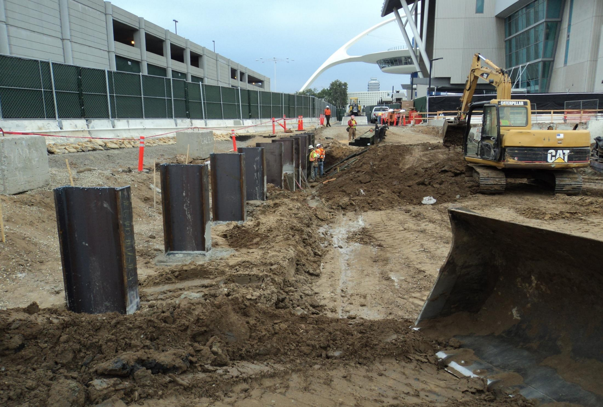
Shoring set in place prior to excavation of new CUP footprint. November 2011