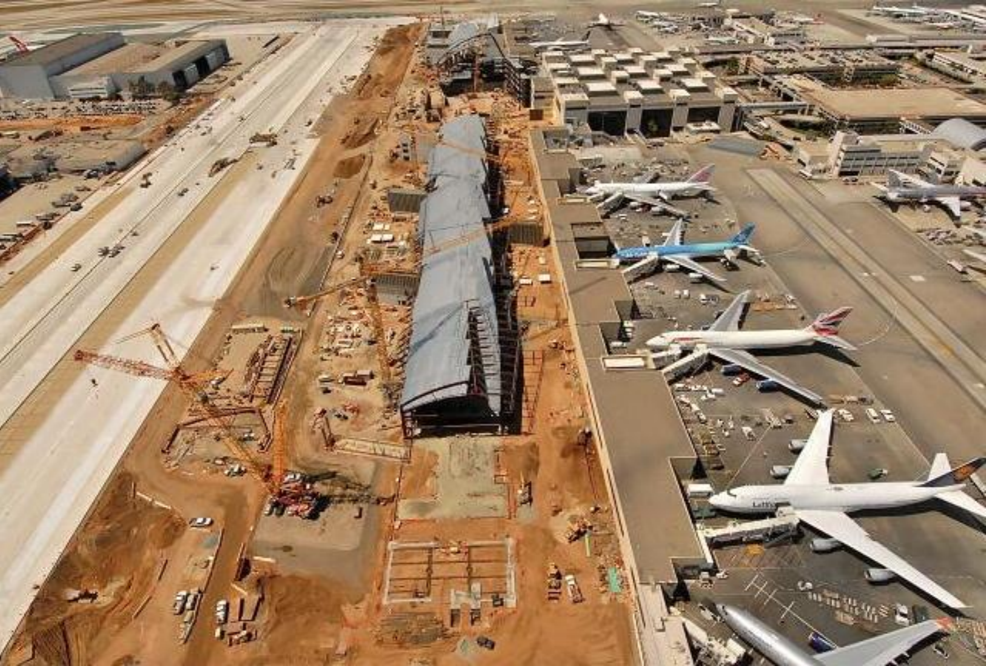
Aerial view of Bradley West South Concourse and Taxiway S (looking north). June 29, 2011