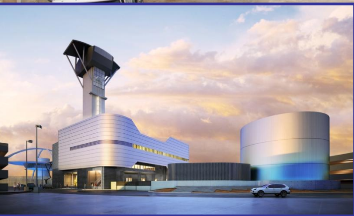
Central Utility Plant construction area. July 7, 2011