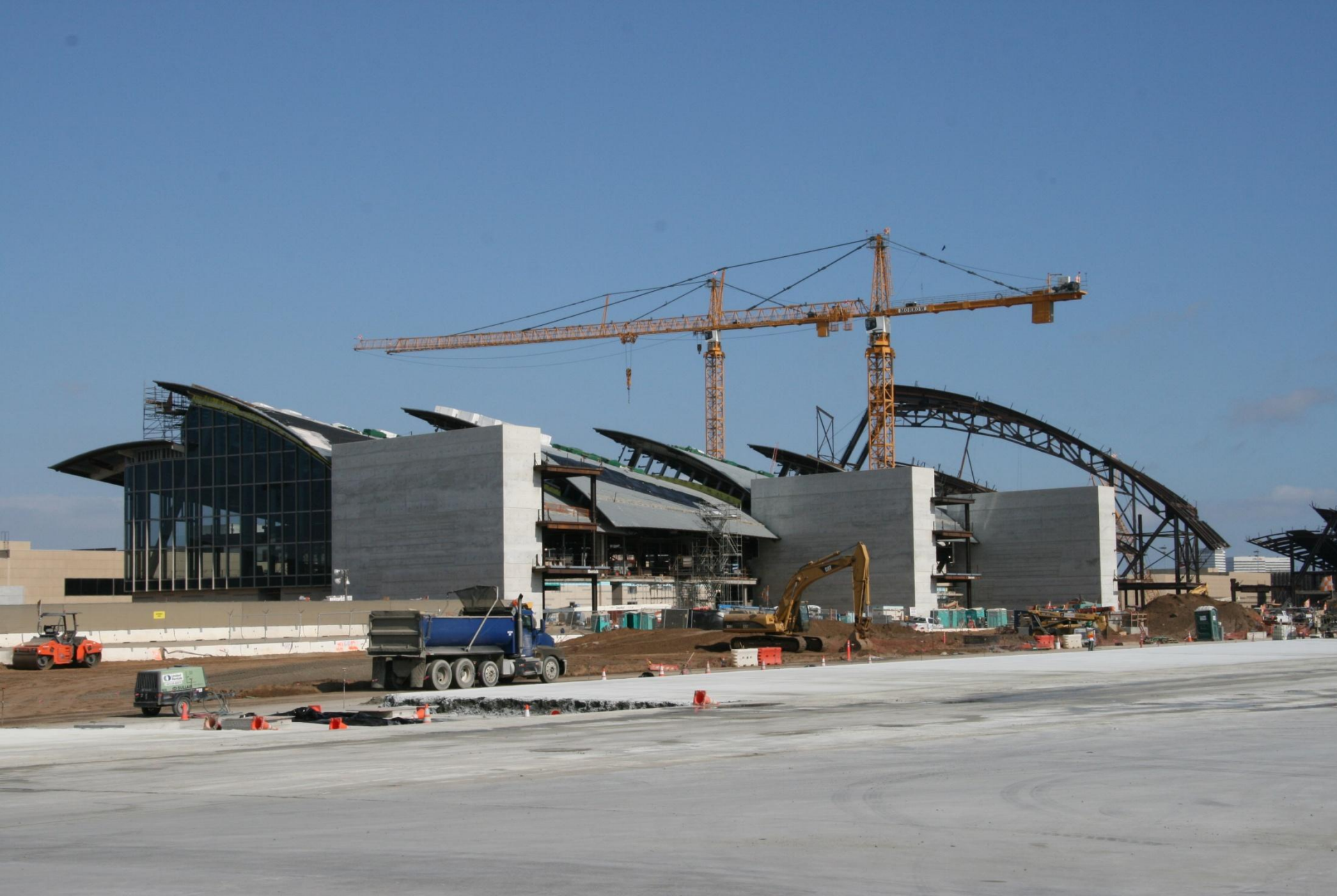
Bradley West North Concourse. July 14, 2011