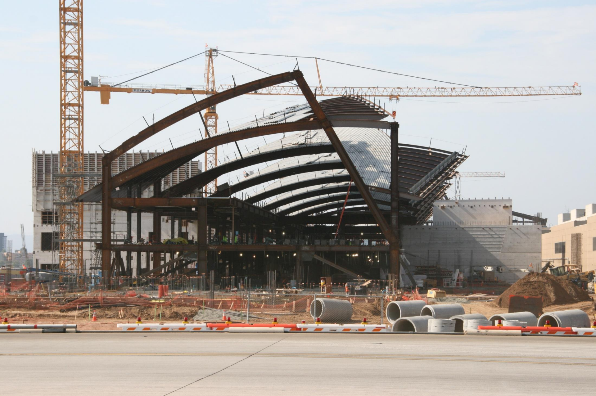
Bradley West South Concourse. July 7, 2011