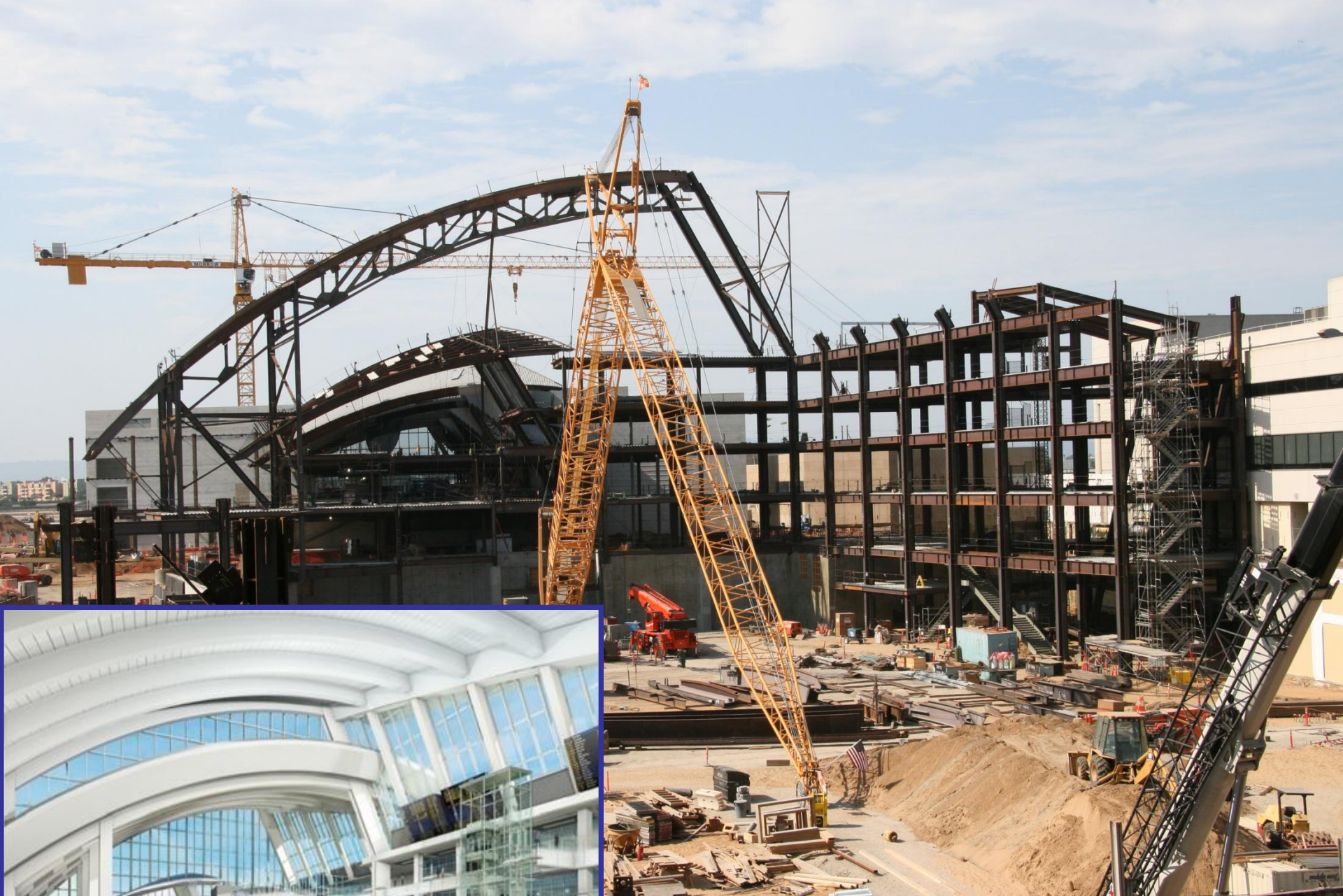
Bradley West Core (Great Hall) July 7, 2011