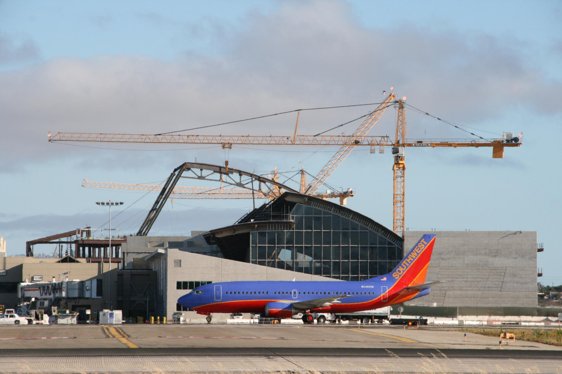
Bradley West North Concourse. First roof truss for core set in place on June 29, 2011. June 29, 2011