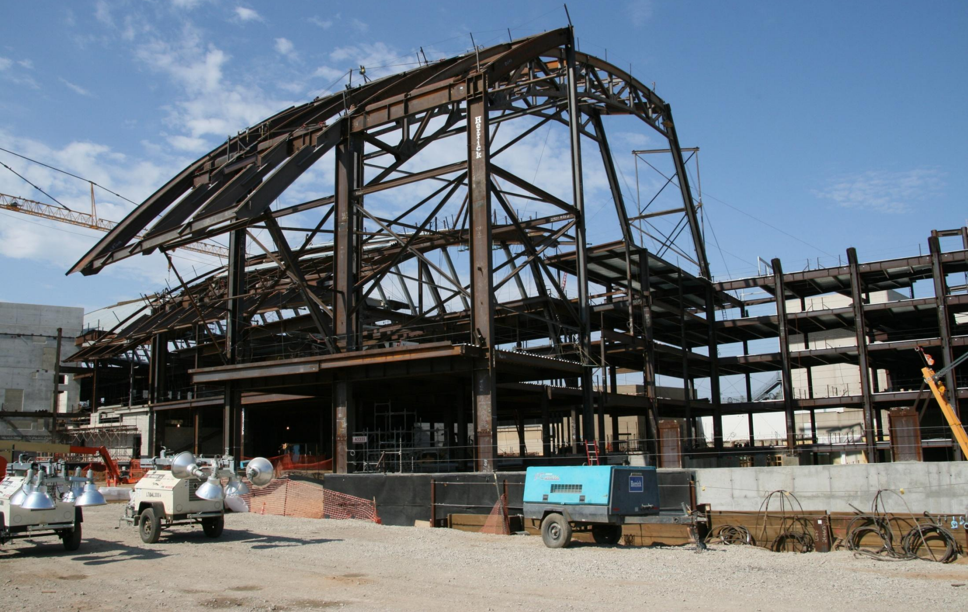
Bradley West Core connecting to North Concourse. July 7, 2011