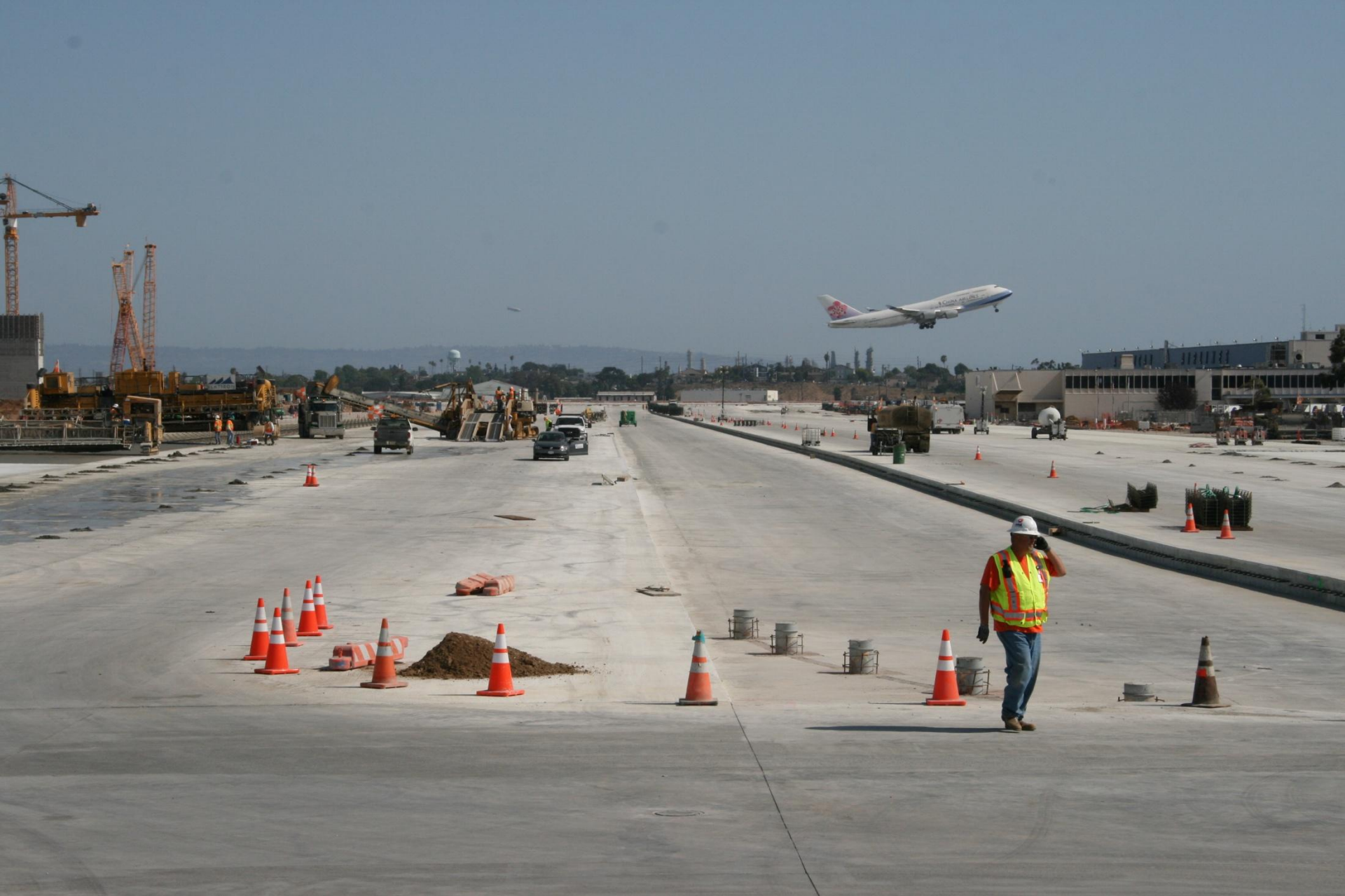
Taxilane S looking south. July 7, 2011