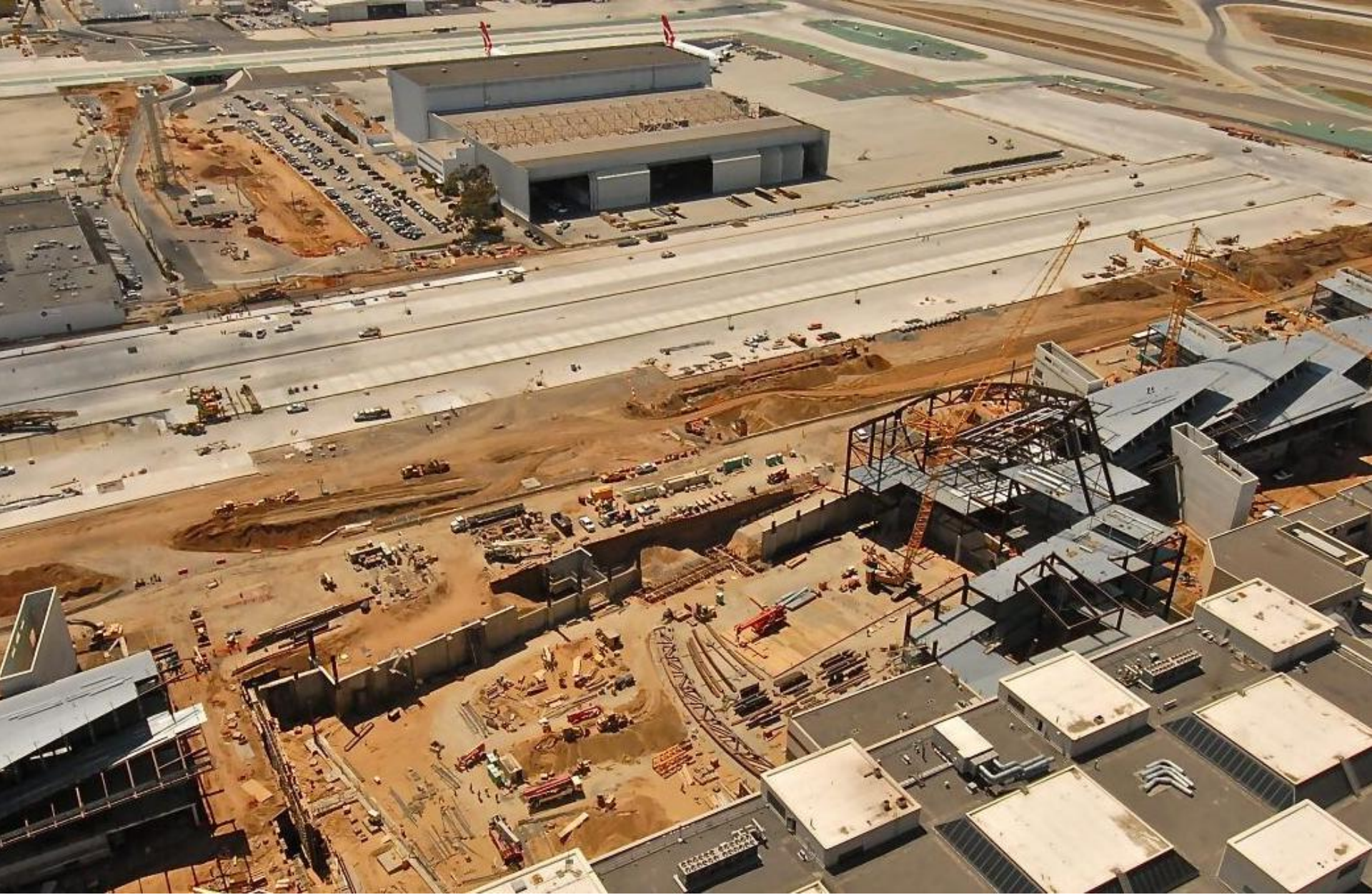
Aerial view of Bradley West Core and Taxiway S. Note the Core is now connected to the North Concourse.