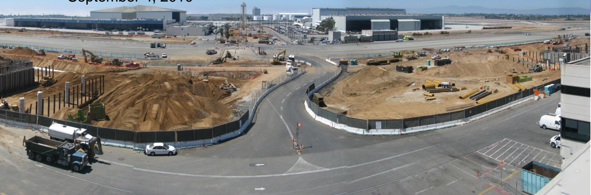
Core (looking west)