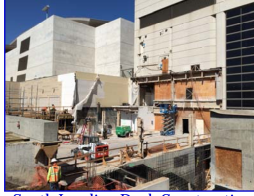
South Loading Dock Construction