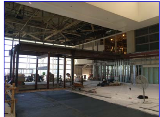
Terminal 4 Connector Bridge