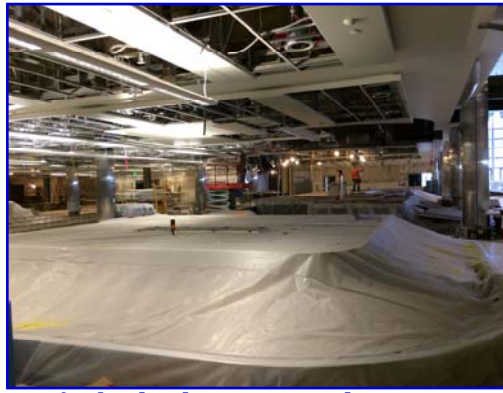
Refurbished Baggage Claim Device