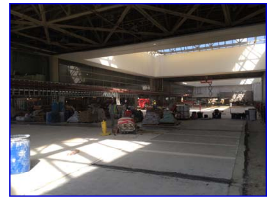
Ticketing Lobby Mezzanine