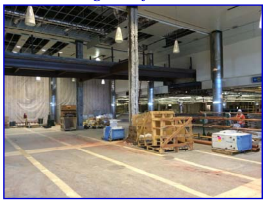
New Inbound BHS Bridge