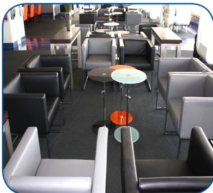
New reLAX Business Lounge offers haven for weary business travelers.

reLax Lounge , LAX's first pay-to-use business lounge, opened its doors in early December to all travelers regardless of airline or class of service. The lounge is located before passenger security screening on TBIT's mezzanine level.