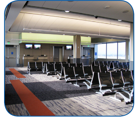
Renovated Gates 101 and 102

The new open areas exude optimism, brightness and cheerfulness. Now that's the way to start a trip!