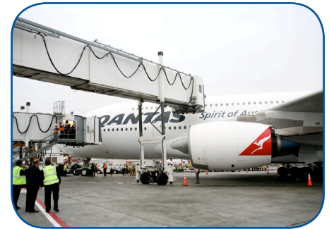
QANTAS A380 docks at Gate 101.

According to the Los Angeles County Economic Development Corporation, the new QANTAS A380 service will generate $723 million in annual economic output, 3,900 jobs, and $188 million in wages annually.