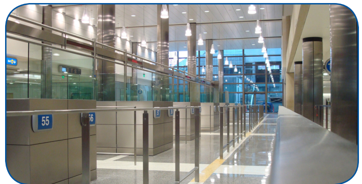
Better lighting and modern facilities facilitate the customs process.

that can handle the larger passenger loads associated with new-generation aircraft, are already allowing passengers to claim their bags faster.