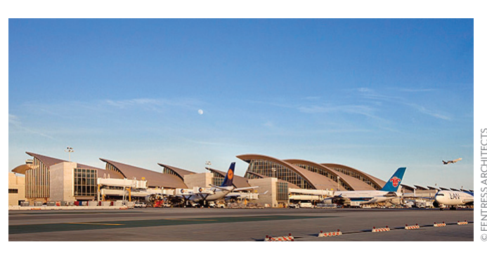
Exterior view of the New Tom Bradley International Terminal, that vastly improves the quest experience and changes the face of LAX.