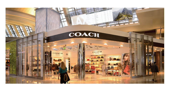
View of Great Hall with 150,000 square feet of premier dining, retail shopping and other passenger amenities, such as the Integrated Environmental Media System.