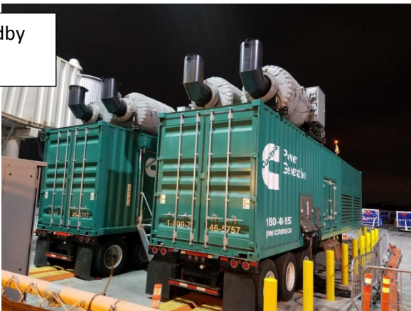
Two new standby generators