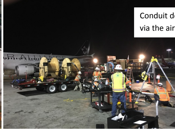
Conduit delivery via the airside