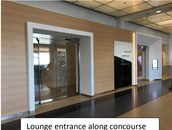
Lounge entrance along concourse