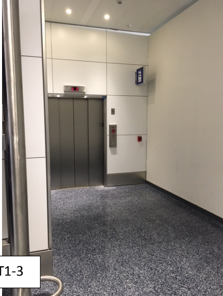
Open: elevator T1-3