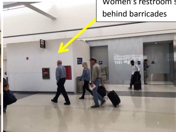
Women's restroom still behind barricades