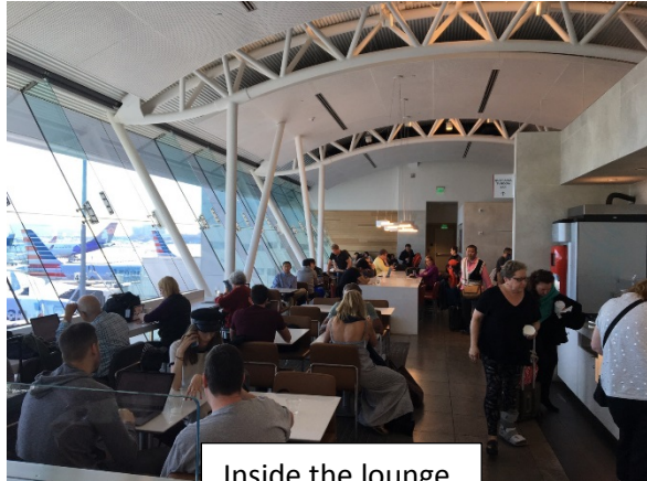
Inside the lounge