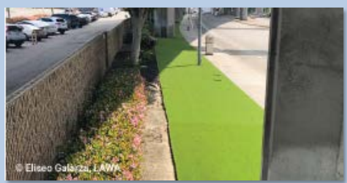
Artificial turf along the Imperial highway.