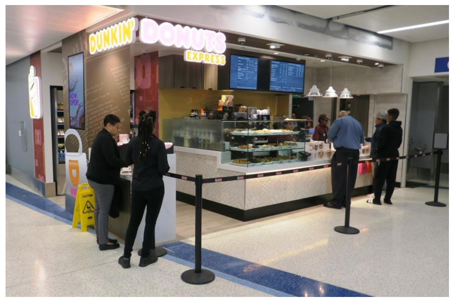
Dunkin' Donuts Express has opened near Baggage Claim 1 on the Lower/Arrivals Level at Terminal 7.