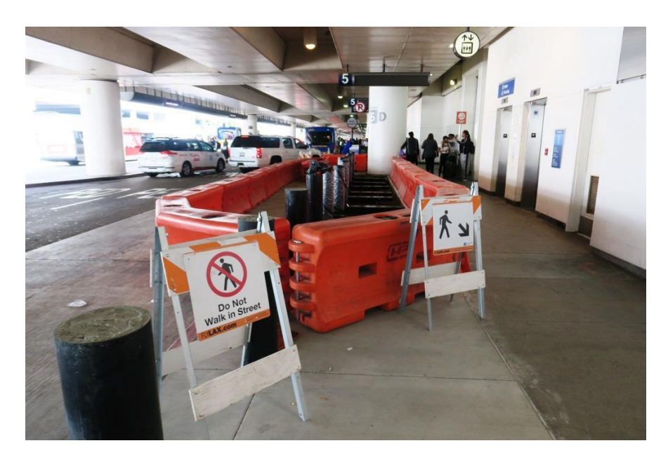
Bollard installation will continue on the Upper/Departures and Lower/Arrivals levels at LAX throughout 2018. Pedestrians will be detoured during the day, with some overnight lane closures.