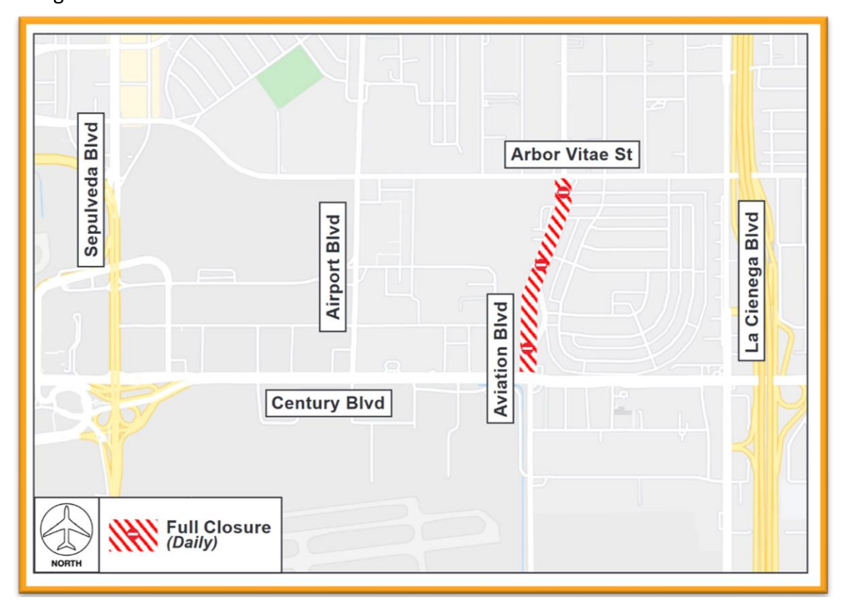
A portion of Aviation Boulevard will be closed during the day on Saturday, November 5 and Saturday, November 12, to facilitate conduit and cable installation