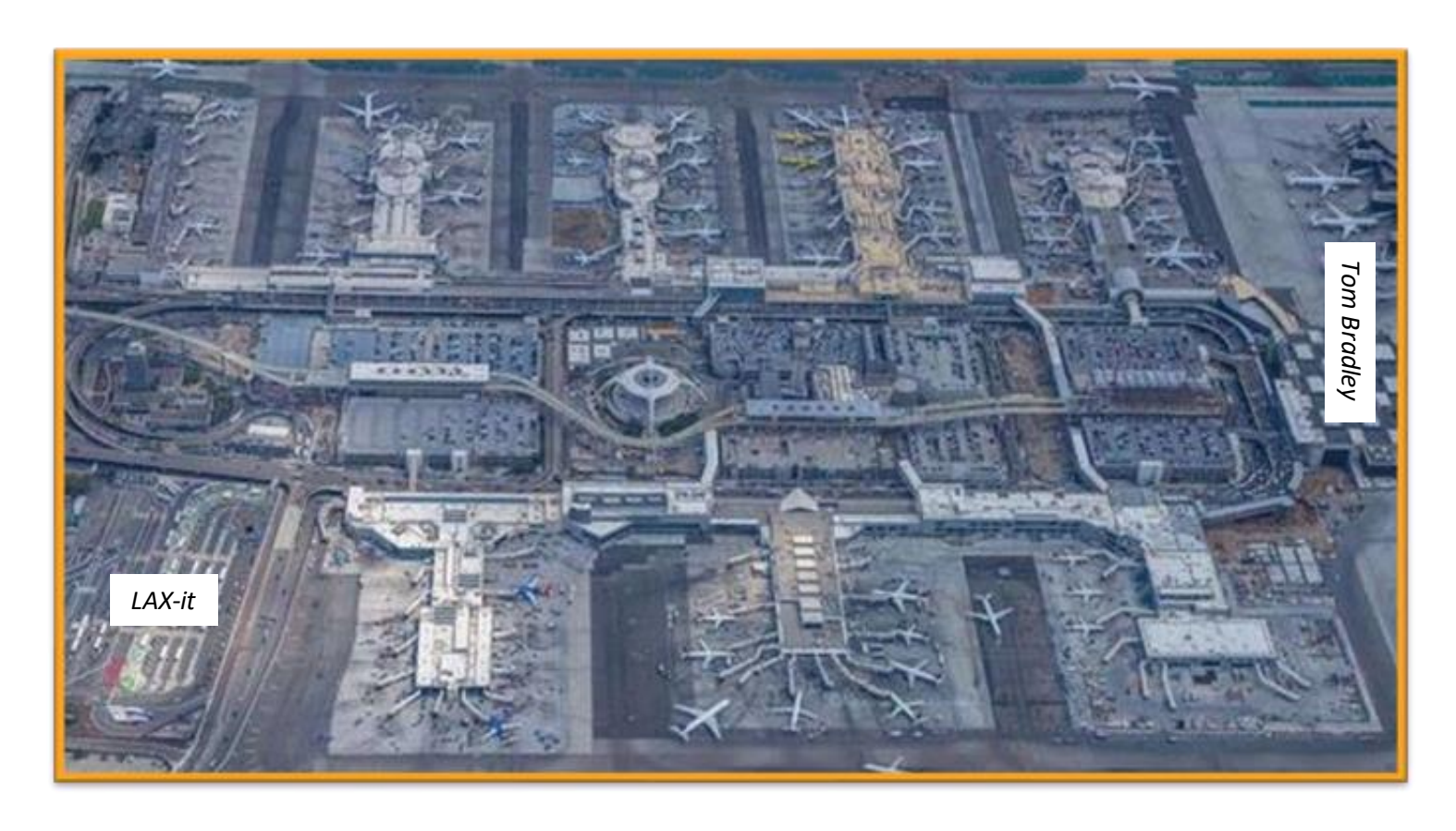
Aerial imagery of the Automated People Mover guideway, stations and pedestrian bridges in the Central Terminal Area