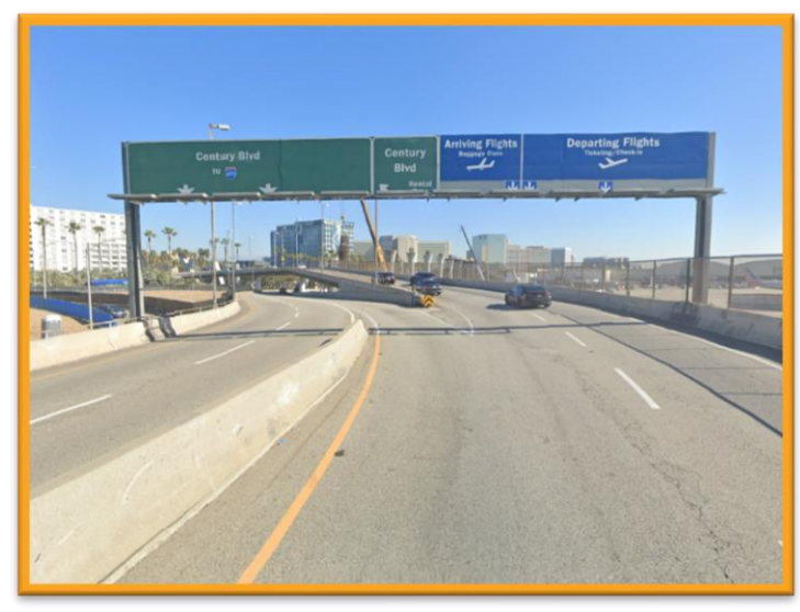
Ramps to eastbound Century Boulevard / Airport Entry Flyover