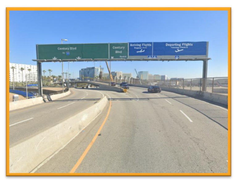
Ramps to eastbound Century Boulevard / Airport Entry Flyover