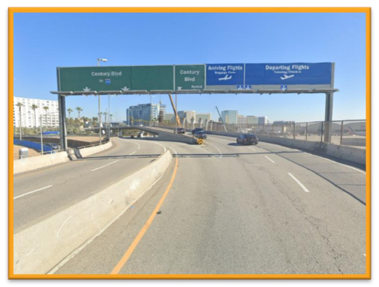
Ramps to eastbound Century Boulevard / Airport Entry Flyover