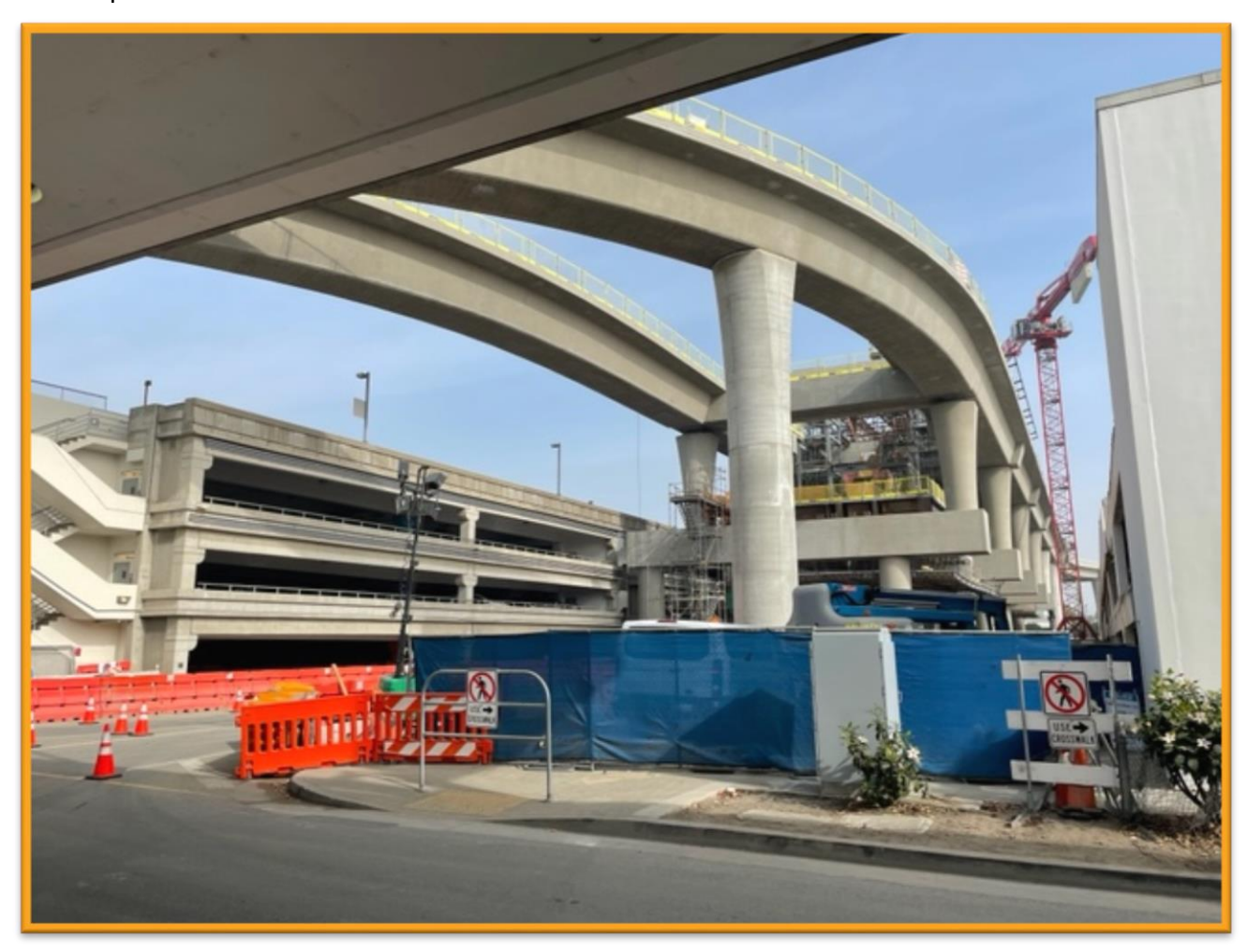
APM East Station between PS-1 & PS-7