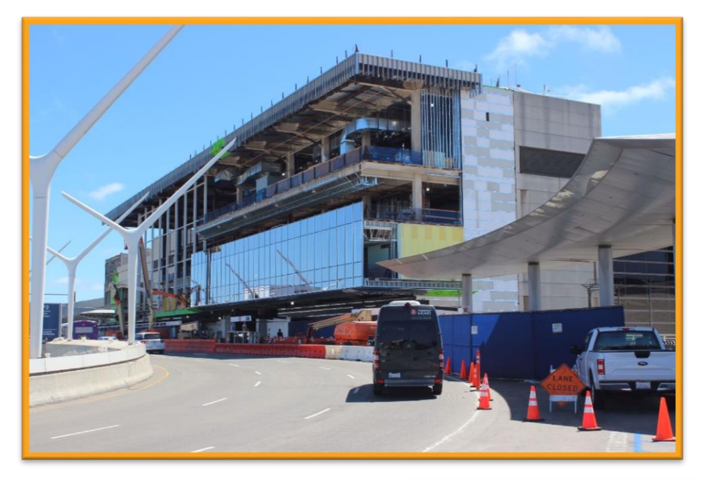
Glass installation at Terminal B's north end