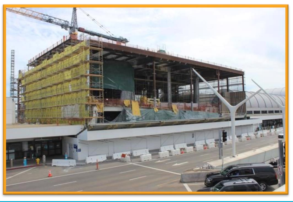
Terminal 4.5 Progress: June 2021