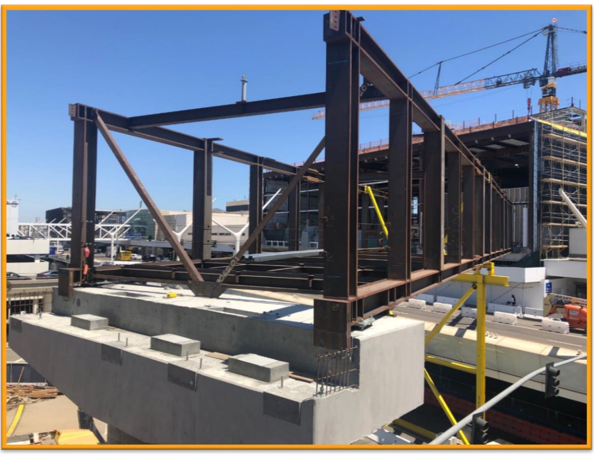
Terminal 4.5 Pedestrian Bridge Installation