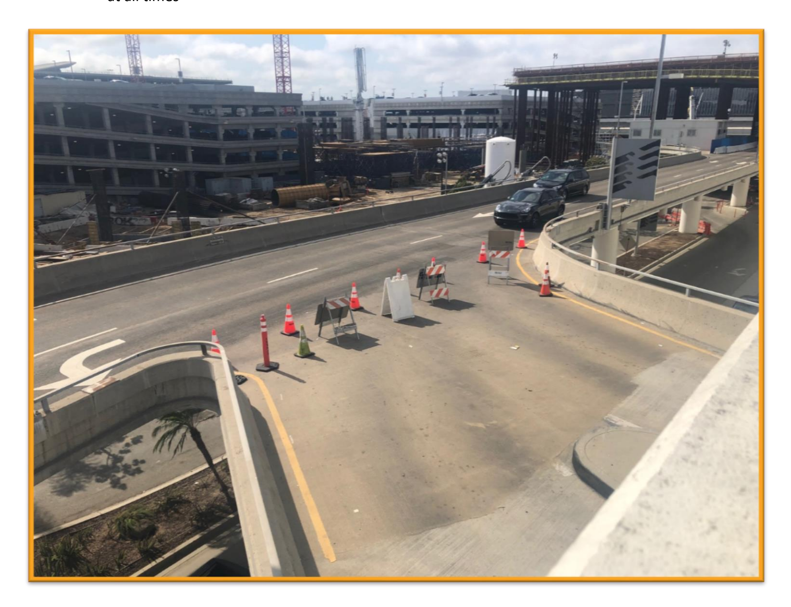
Parking Structure 5 Departures Entrance Closed through 5/21/21