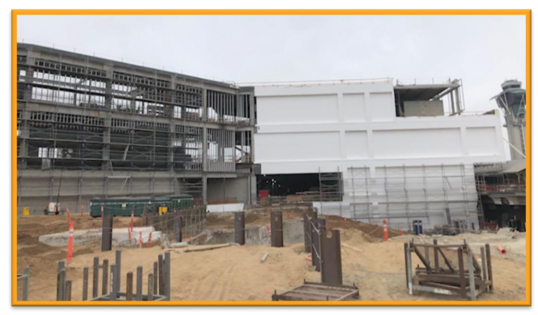
Terminal 2 / 3 Renovation Progress as of May 2021