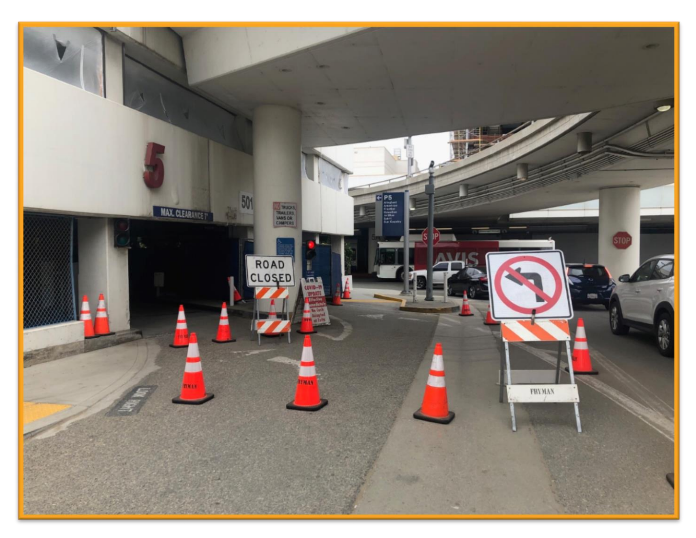
Parking Structure 5 Arrivals Entrance Closed through 5/14/21