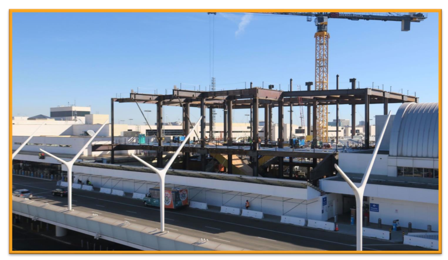
The future Terminal 4.5 Core building takes shape, pictured from Parking Structure 4