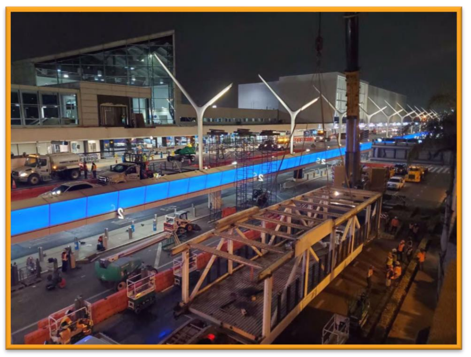
Pedestrian Bridge between Terminal 2 and Parking Structure 2A during removal