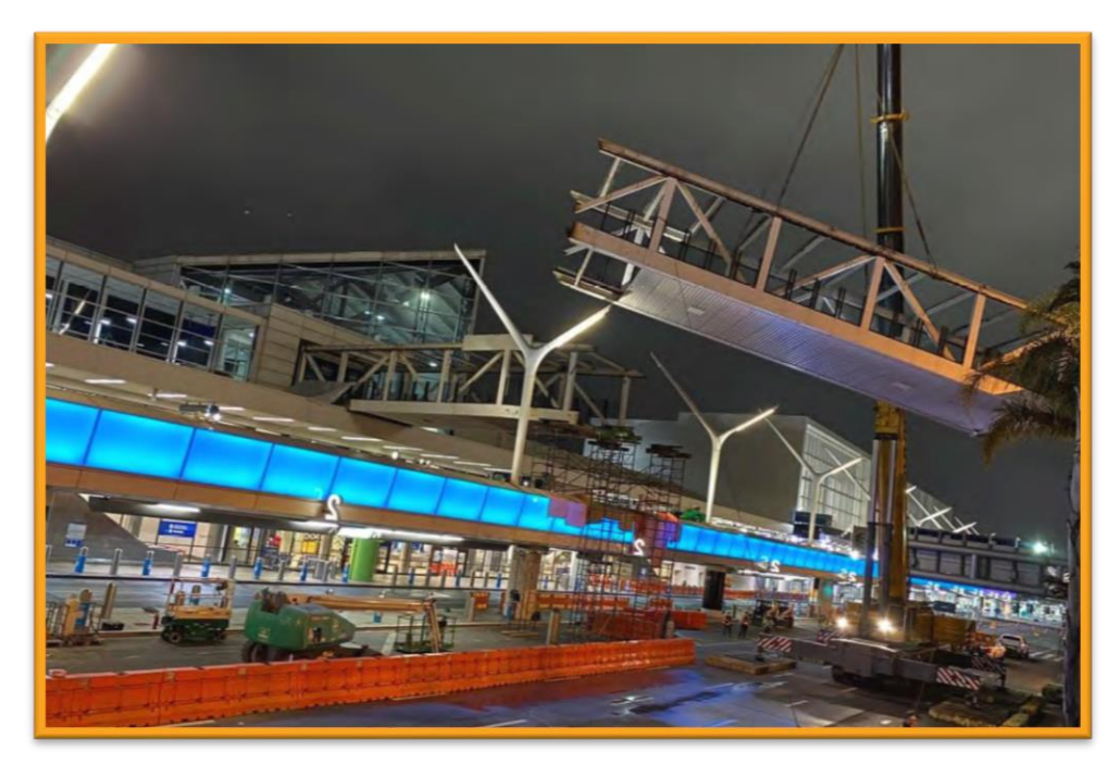
Pedestrian Bridge between Terminal 2 and Parking Structure 2A during demolition

• The Pedestrian Bridge connecting Terminal 2 and Parking Structure 2A was successfully demolished and removed from the Central Terminal Area last week as part of the Automated People Mover project