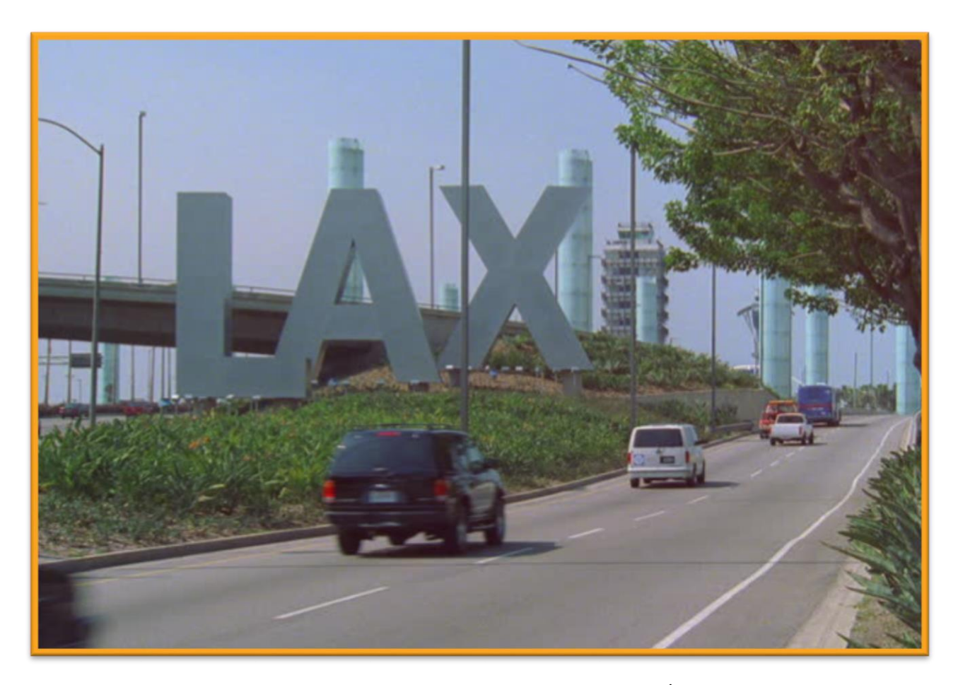
LAX letters being painted at airport entrance / exit