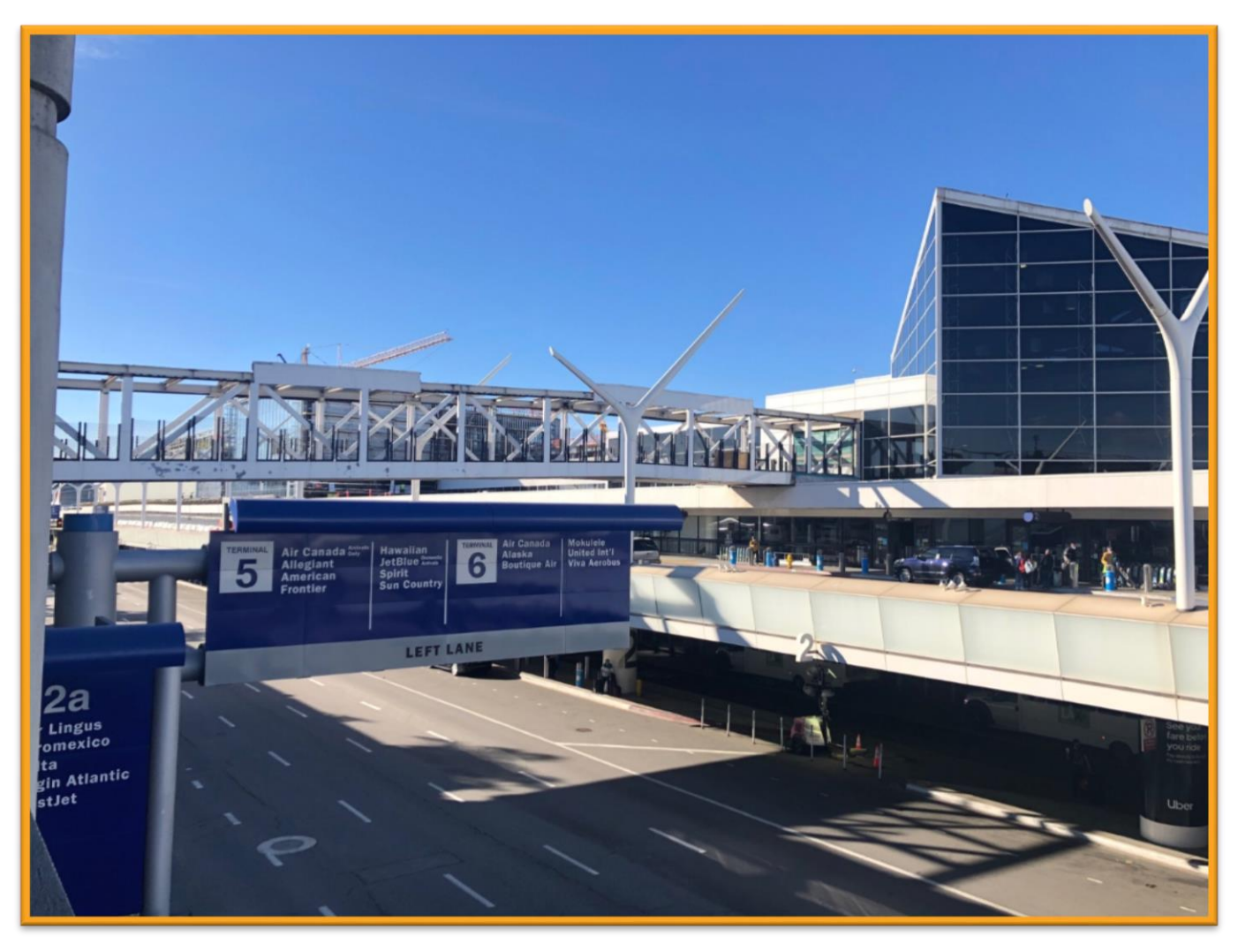
Pedestrian Bridge between Terminal 2 and Parking Structure 2A, pictured from Parking Structure 2A