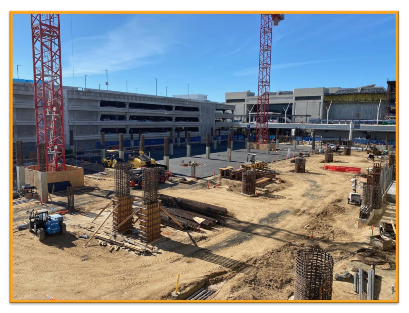
Automated People Mover paving of Ground Level at future West Station site between Parking Structures 3 & 4