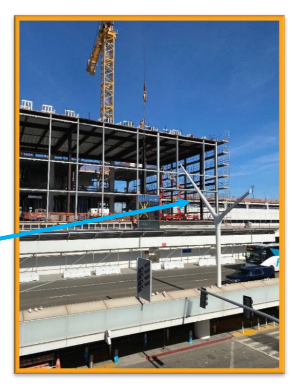
Terminal 2 / 3 Head House glazing & curtain wall installation