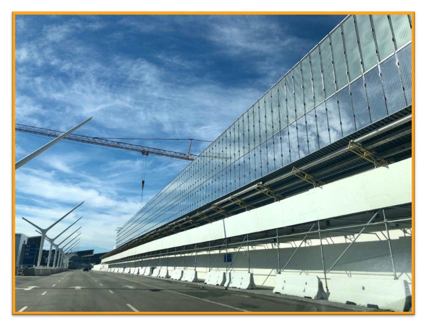
Terminal 2 / 3 Temporary Pedestrian Walkway and Exterior Façade Installation