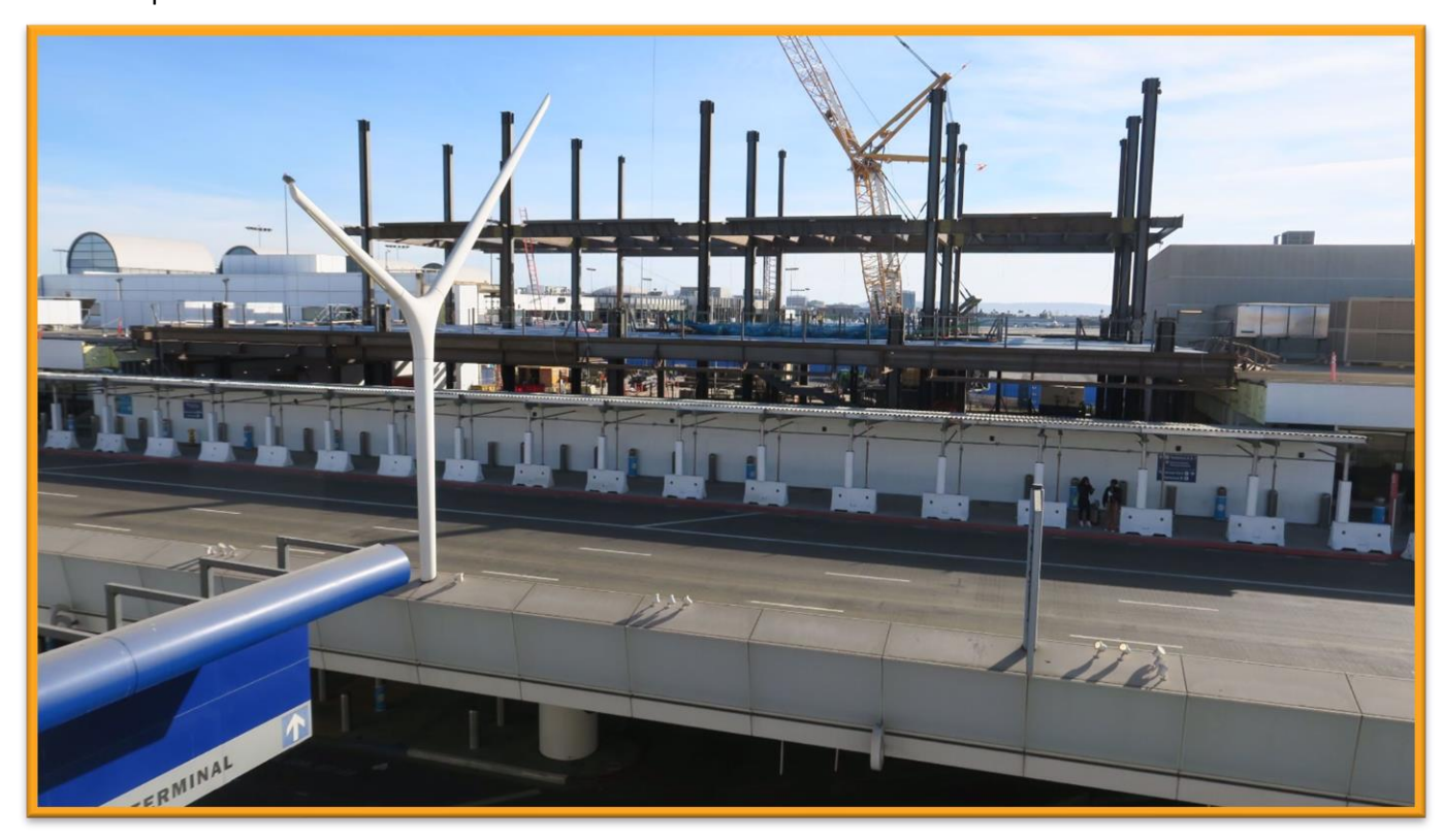
Terminal 5.5 structural steel is visible airside as construction progresses on the project