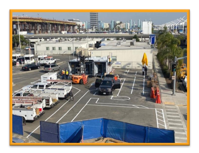
Surface Lot 6 COVID-19 Rapid Testing Facility construction