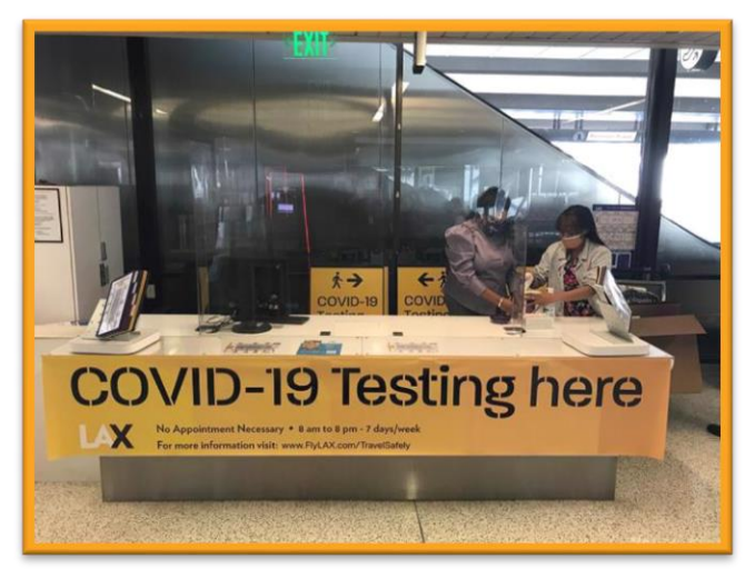
Current COVID-19 test location in Terminal 2