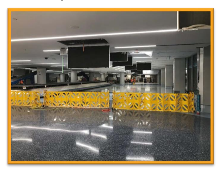
Check-in (left) and bag claim (right) progress inside the new Terminal 1.5