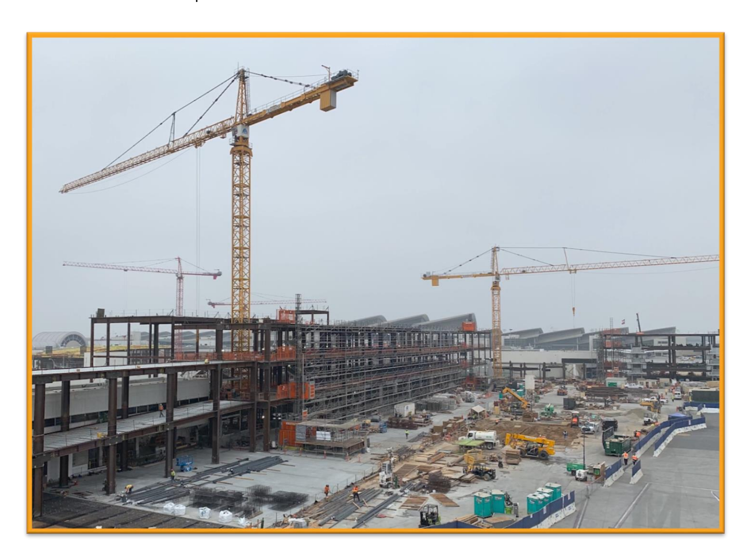
Terminal 2 / 3 Head House construction