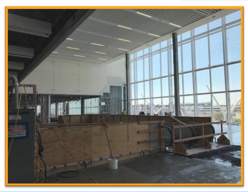
Terminal 1.5 Escalator Installation (Level 2)