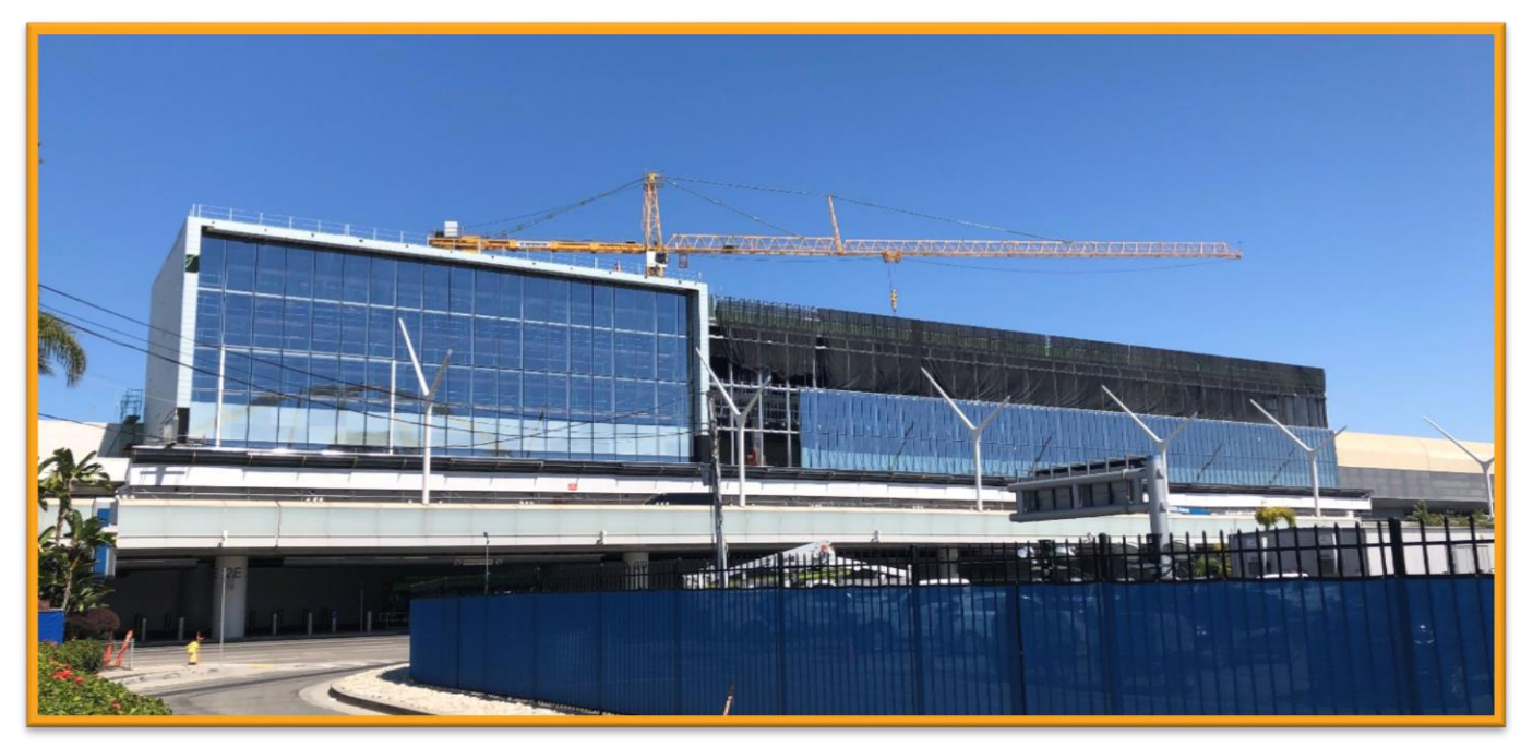
Terminal 1.5 as of Monday, March 25, 2020