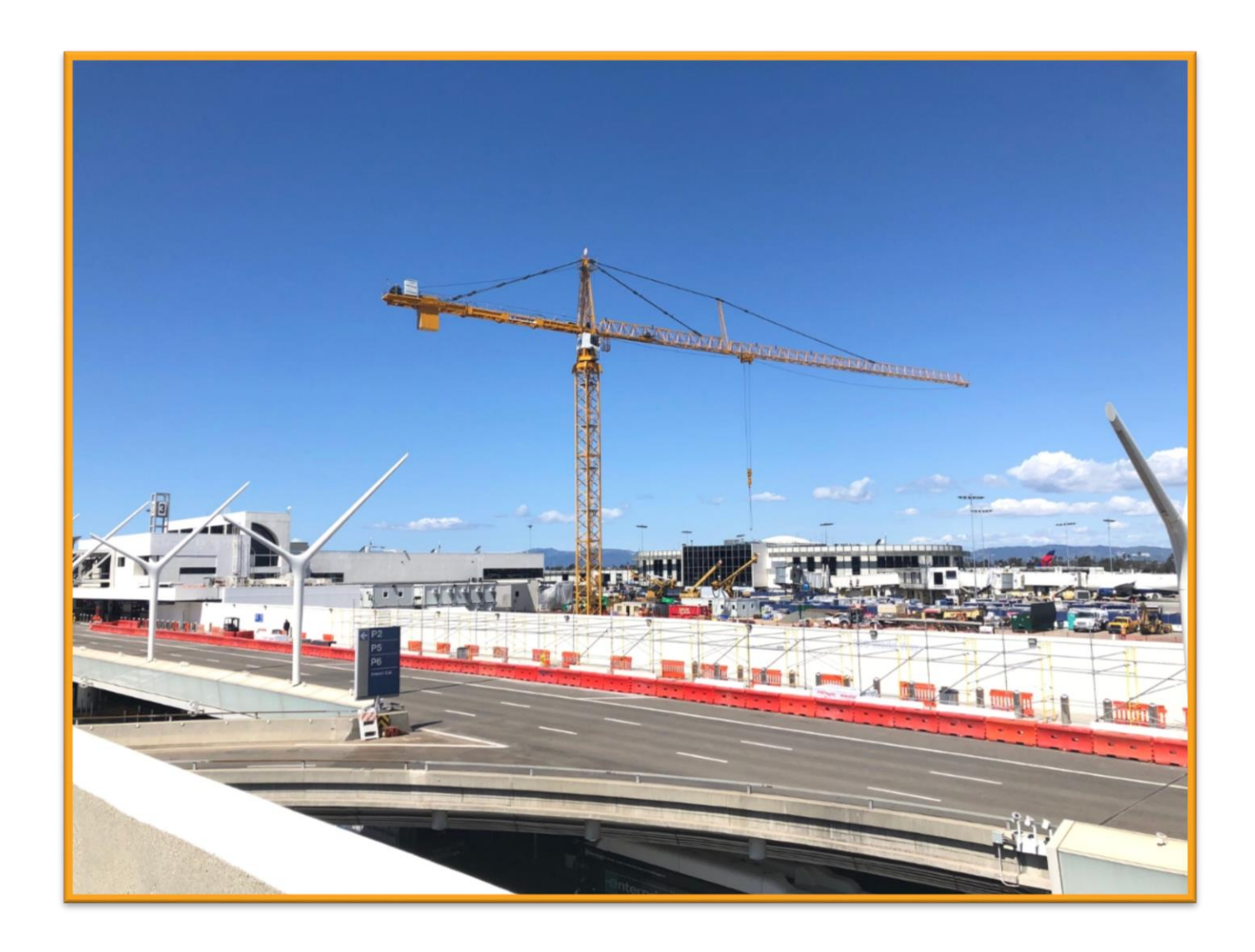
Departures Level construction between Terminals 2 & 3 (roadway)