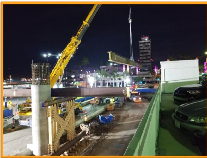
APM falsework on Center Way