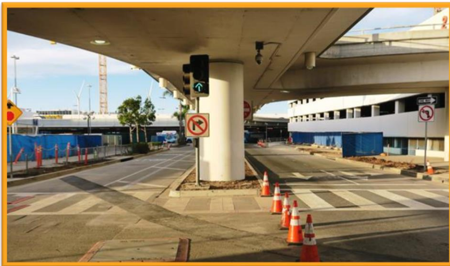
Northbound West Way is closed to maintain southbound West Way traffic during APM