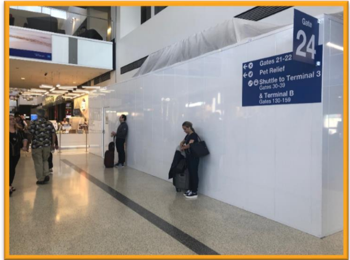
Construction barricades in Terminal 2 concourse