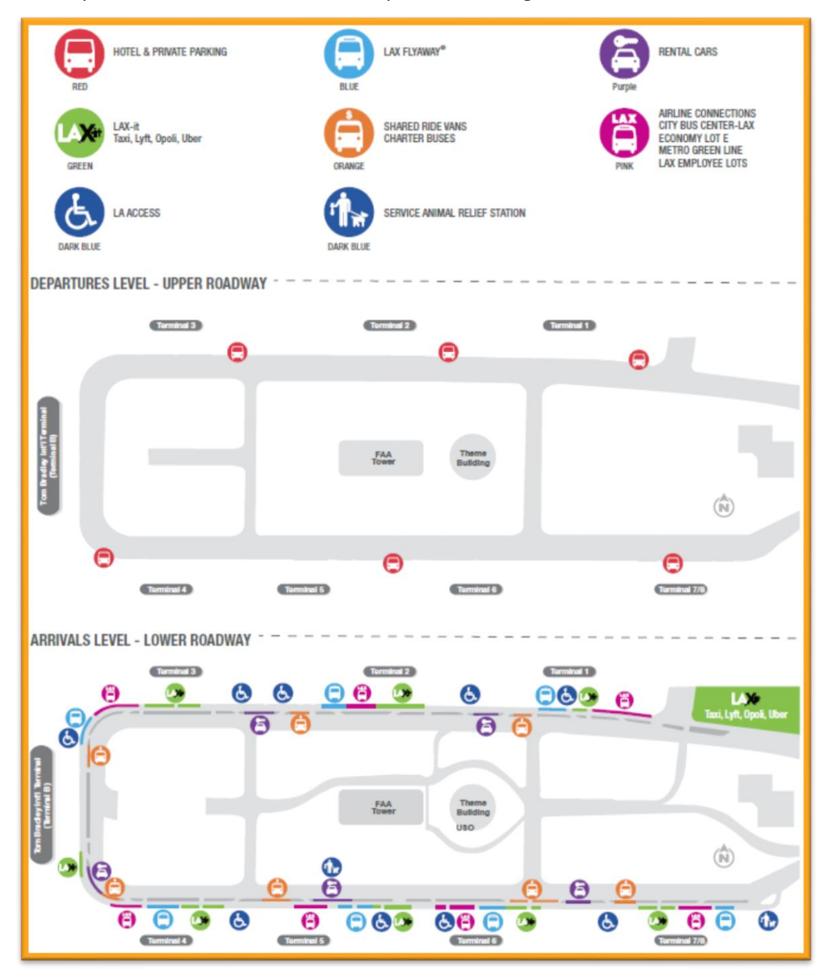
Ground Transportation Waiting Areas as of 12/2/19