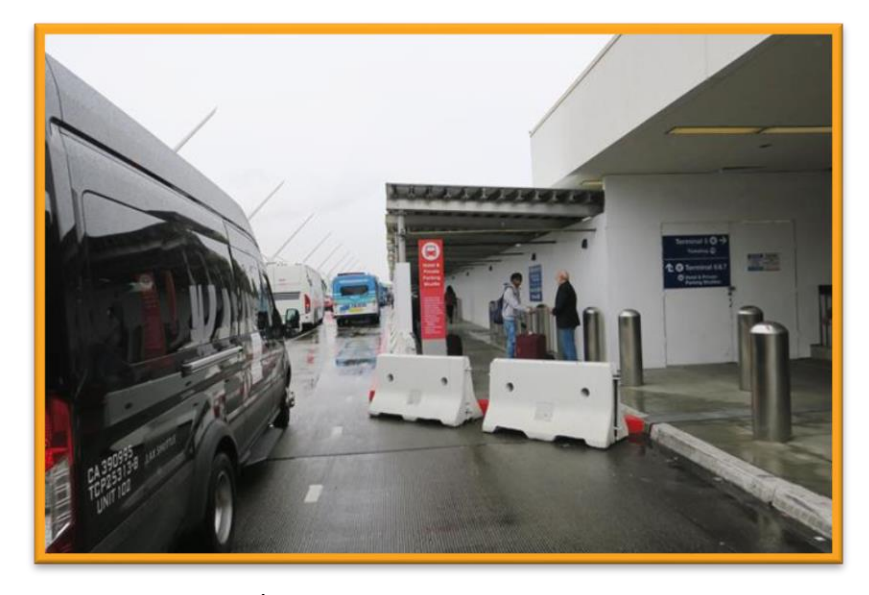
Terminals 5 / 6: Departures Level Pedestrian Walkway