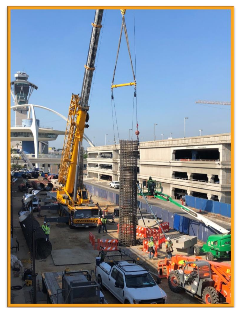
Center Way from PS-7 looking west: APM CIDH Pile Work