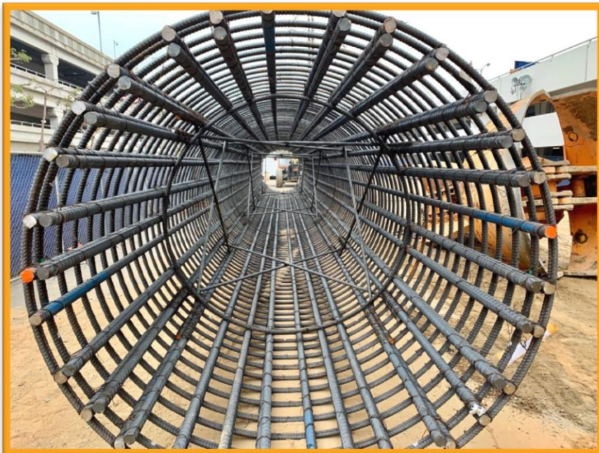
APM rebar cage (part of CIDH pile)