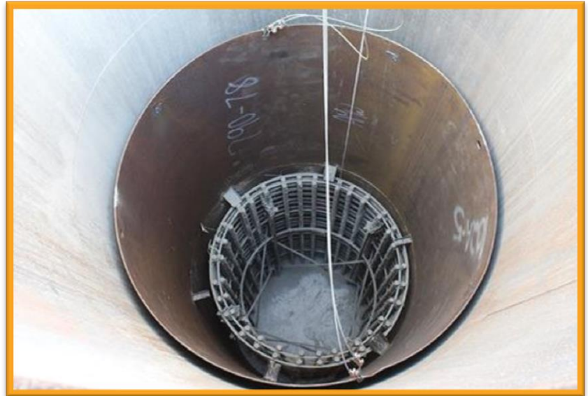
APM CIDH pile with rebar cage and concrete