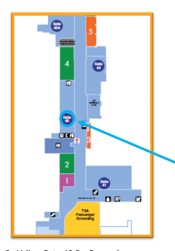
Airline Gate 40