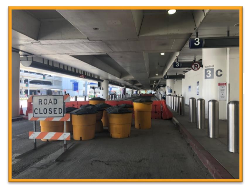
Terminal 3: Arrivals Level