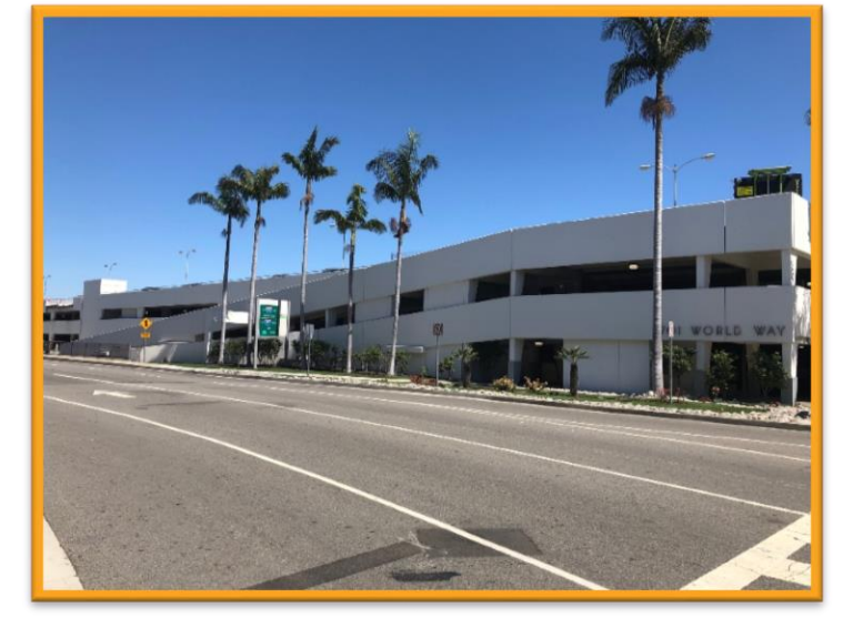
Parking Structure 7 Ramp Demolition

Parking Structure 3 / 4 Bridge Demolition