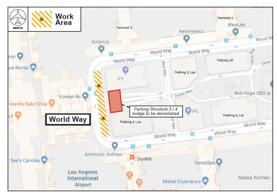
Parking Structure 3 / 4 Bridge

• The bridge between Parking Structure 3 and Parking Structure 4 is scheduled for demolition beginning Wednesday, June 19 through Monday, July 1 for the Automated People Mover project (work rescheduled from original start date of Monday, June 10)