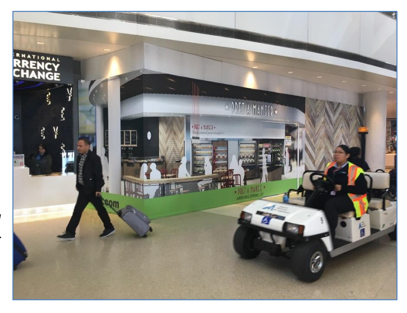
Terminal B, Great Hall Future Pret a Manger

Pret a Manger is scheduled to open in Terminal B's Great Hall on Tuesday, June 18 (toward North Concourse near Currency Exchange / Food Court)