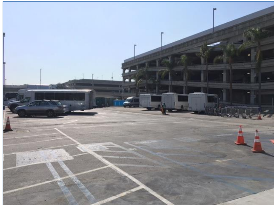
Interim Bus Lot