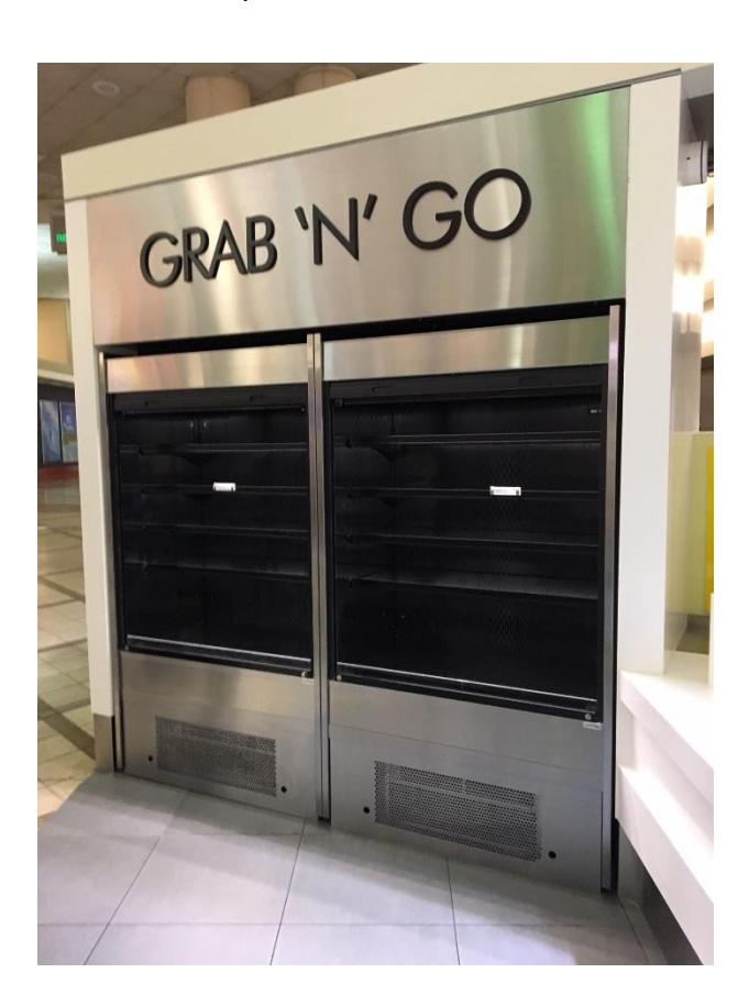
Terminal 5 Lemonade