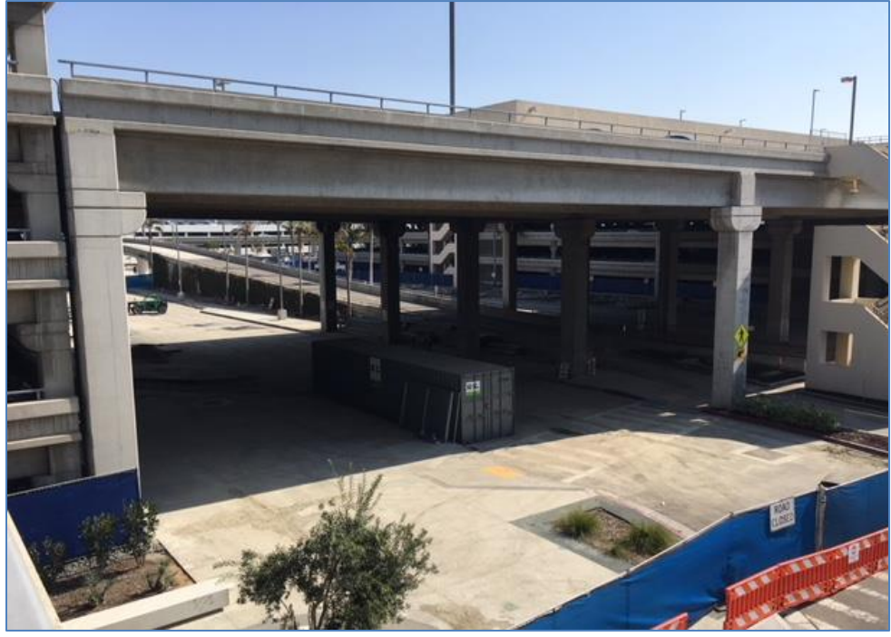
Parking Structure 3 / 4 Bridge to be Demolished