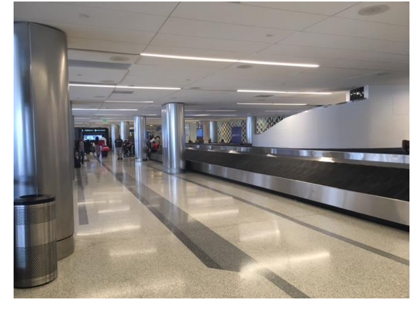
Terminal 2 Arrivals Level