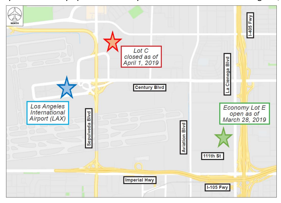
Proximity Map: Los Angeles International Airport, Lot C, and Economy Lot E