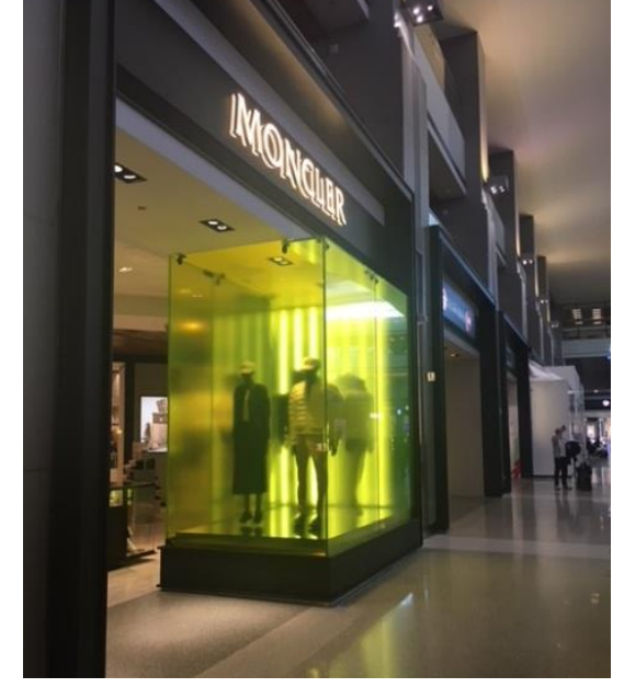
Terminal B Great Hall (Departures Level)