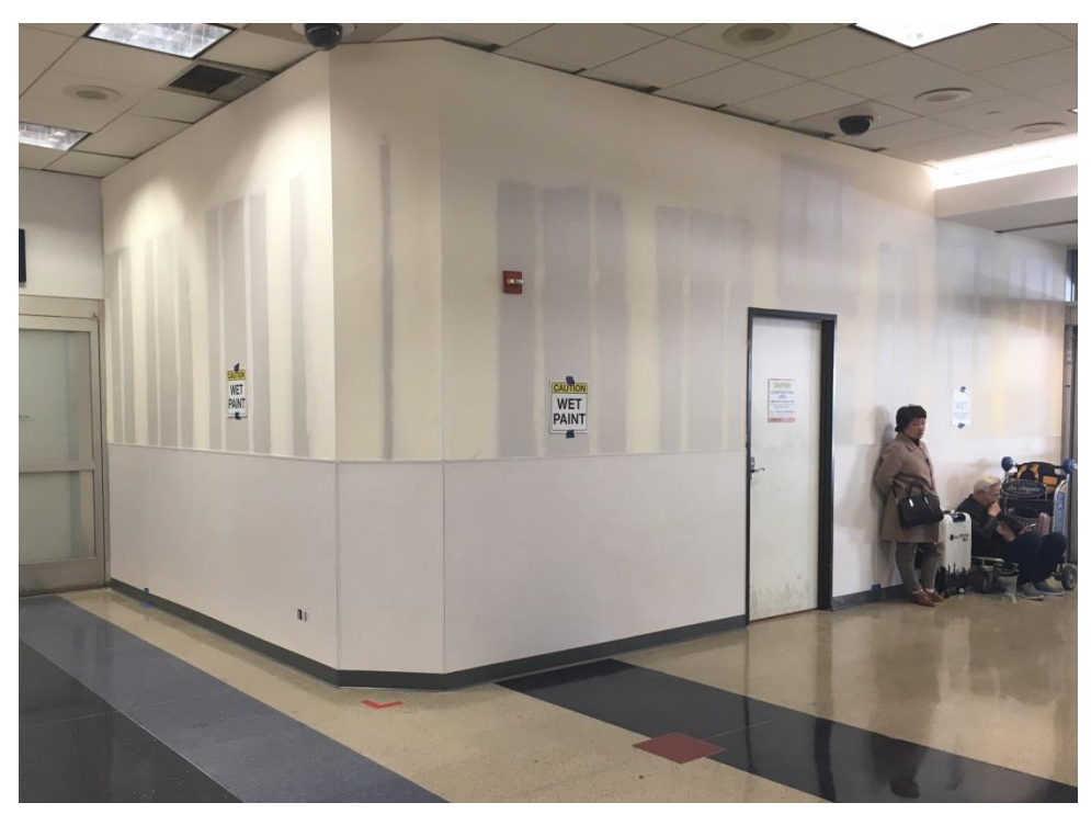
Terminal 4, Arrivals Level