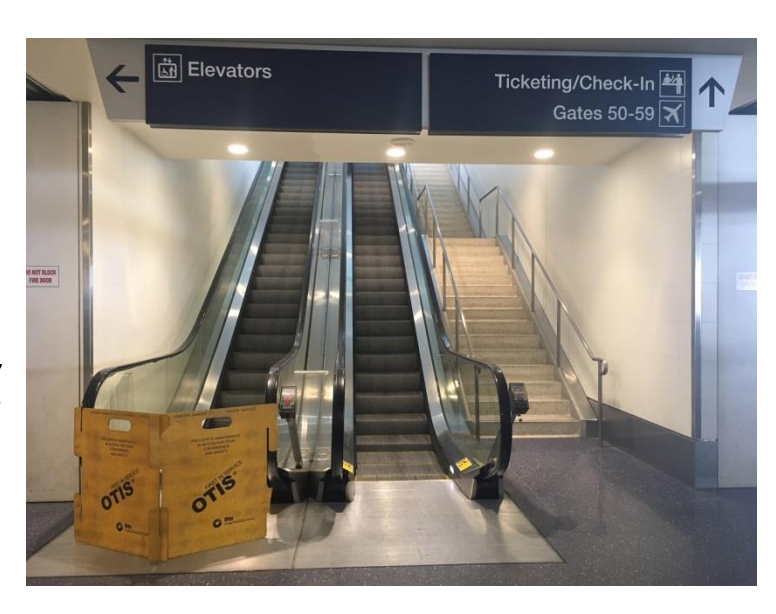
Escalators 6 & 7 Terminal 5