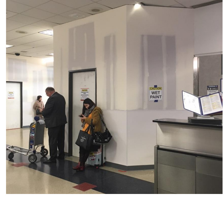
Terminal 4, Arrivals Level