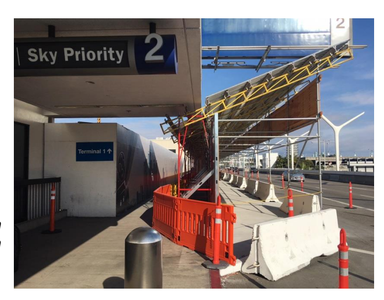
Departures Level, Curbside (between Terminals 1 & 2) Canopy Construction