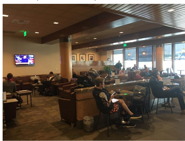
Alaska Airlines Lounge Terminal 6