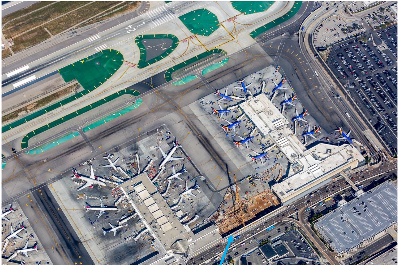
Terminal 1.5 Construction Site, Airside