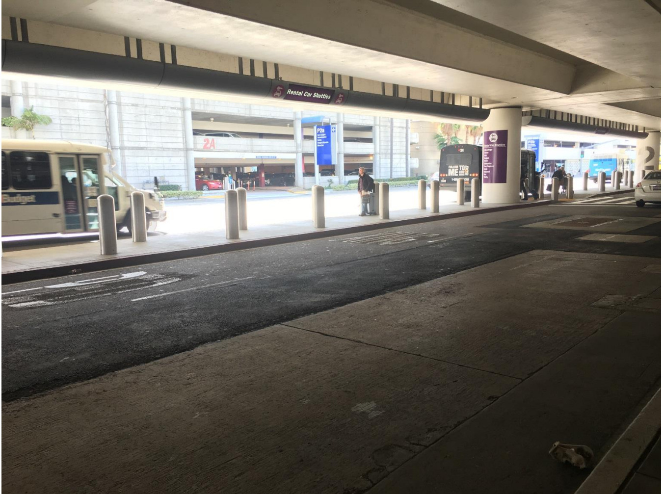
Arrivals Level, Curbside (Terminal 2) Lanes Restored