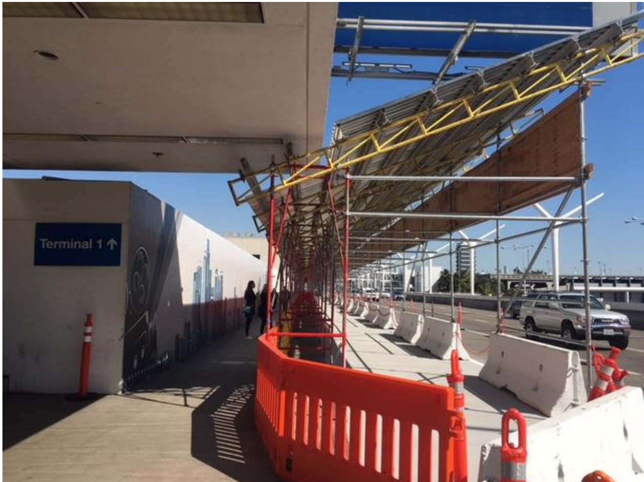
Departures Level, Curbside (between Terminals 1 & 2) Canopy Construction