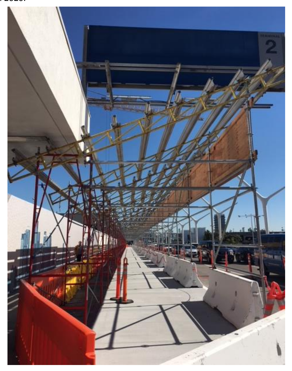
Departures Level, Curbside (between Terminals 1 & 2) Canopy Construction