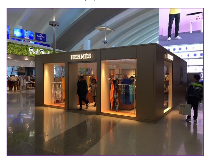
Terminal B, Concourse (Great Hall)

• The temporary Hermes store in Terminal B's Great Hall is now open. It will remain operational until construction is complete on the permanent Hermes within a portion of the Duty Free Shop at the same area (expected Q3 2019).