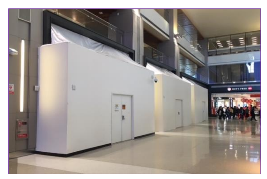
Terminal B DFS / Great Hall Area