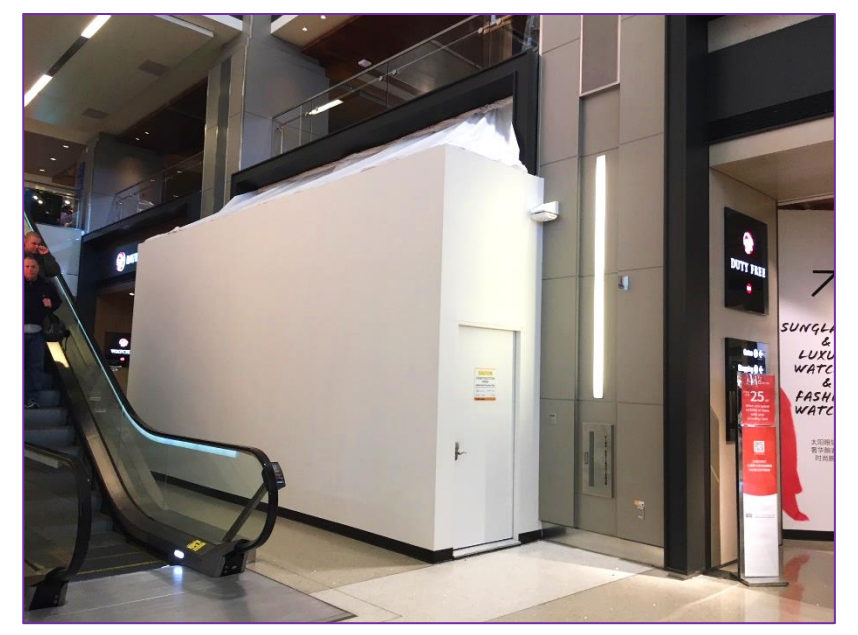
Terminal B, Concourse (Great Hall Area)