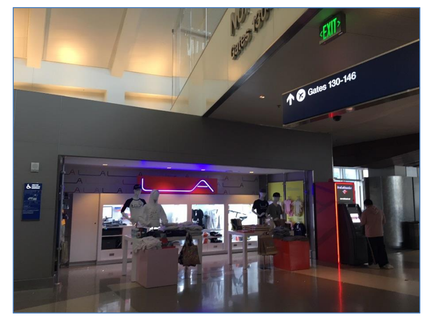
Terminal B, Concourse (Northern Gates)

• An "LA Original" store has opened in Terminal B's Concourse (approaching northern gates); LA Original is a pilot program of the Mayor's Fund for Los Angeles selling merchandise designed and created by Los Angeles locals