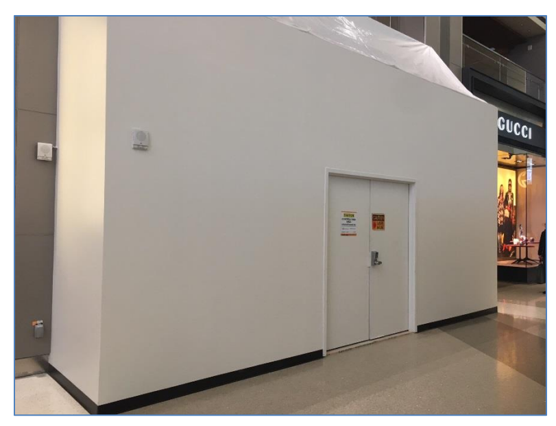
Terminal B, Concourse (Great Hall Area)